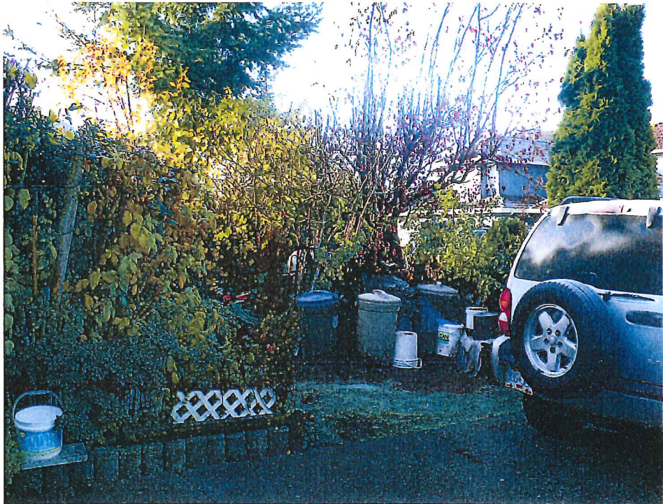
4640 Carter Drive – November 26, 2012