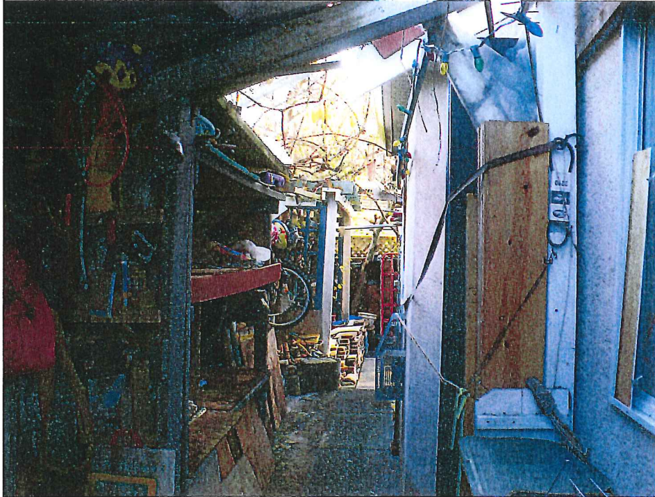
Above photo is still walkway in from the north side of the property