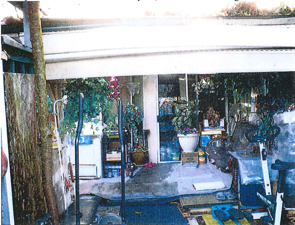
Standing at the back of the property looking towards the house 4640 Carter Dr – November 26, 2012