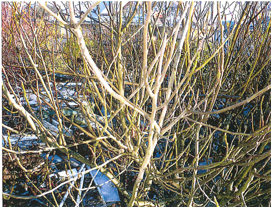
Photos from neighbouring house looking onto 4640 Carter Drive, from her child's bedroom.