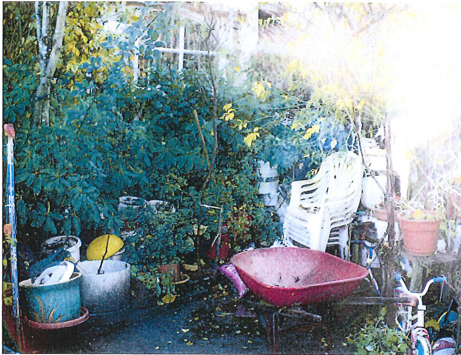
Above photo of the front yard 4640 Carter Dr – November 26, 2012