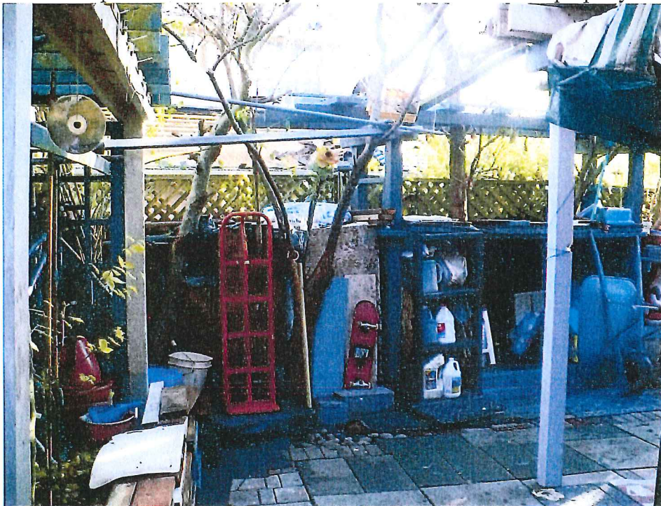
Backyard looking towards neighbours house in the back 4640 Carter Dr – November 26, 2012