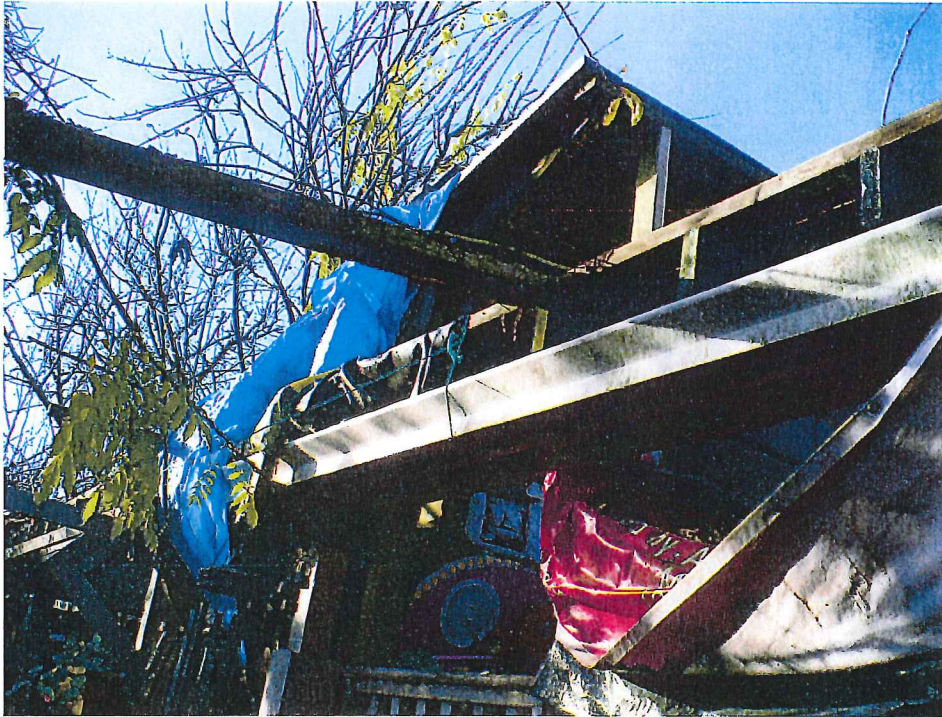
Top of the structure in the backyard, this is what the neighbours see.