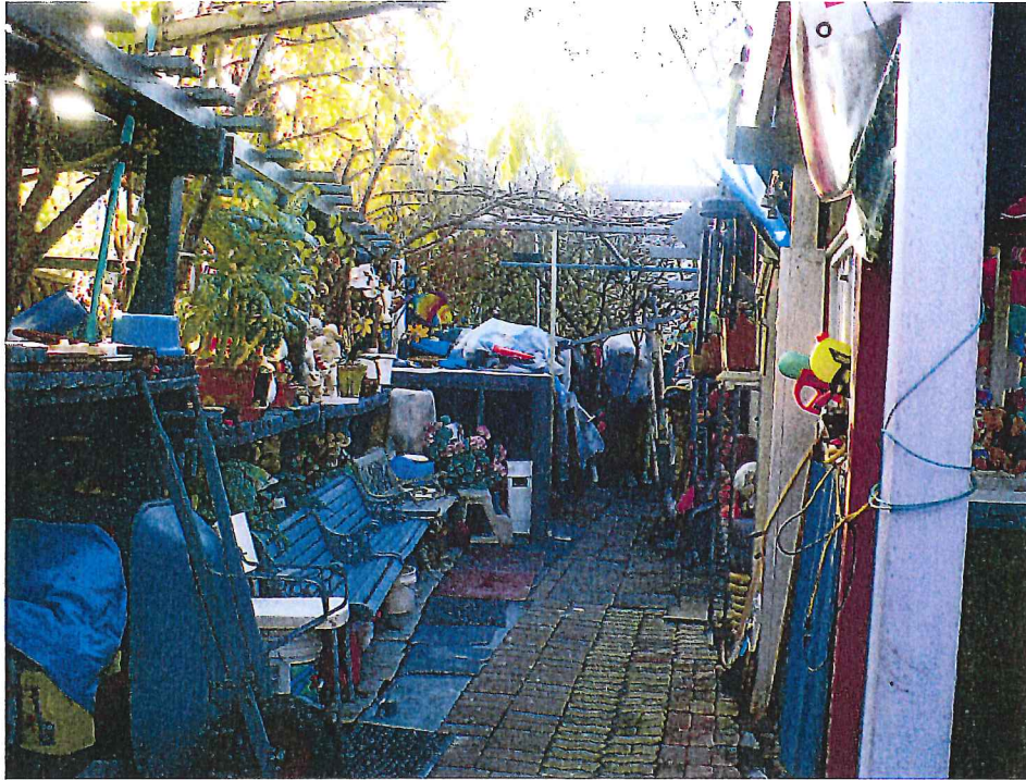
Above photo standing at the north side looking south. Back of the property