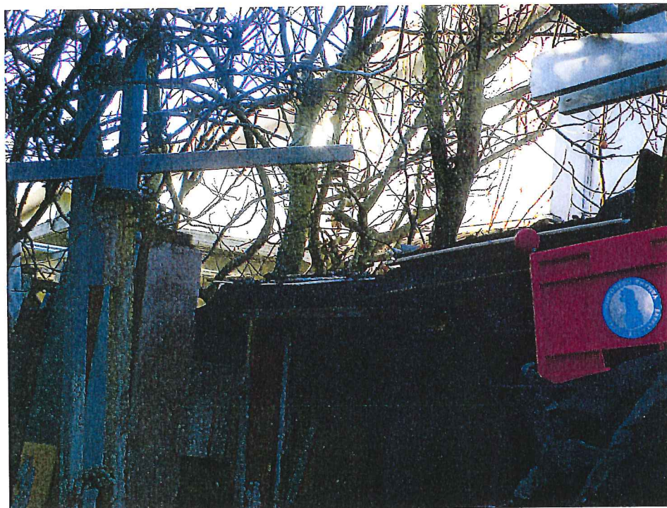
South side of property looking at neighbouring house 4640 Carter Dr – November 26, 2012 – Photos taken by Tracy Christopherson