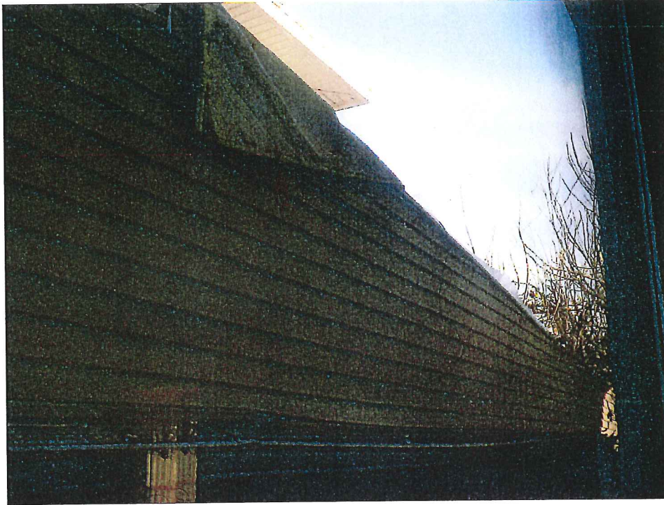
Photo from a neighbouring house looking out of their dining room looking 4640 Carter Drive at the structure along the fence line.