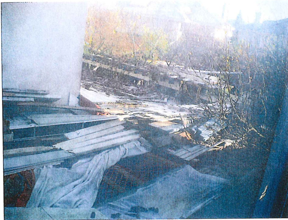
Photos from neighbouring house looking onto 4640 Carter Drive, from her child's bedroom.