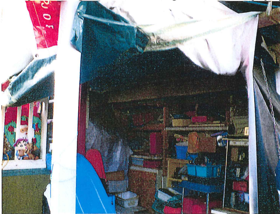
This is just turned right from the previous photo looking in the direction of the house. 4640 Carter Dr – November 26, 2012