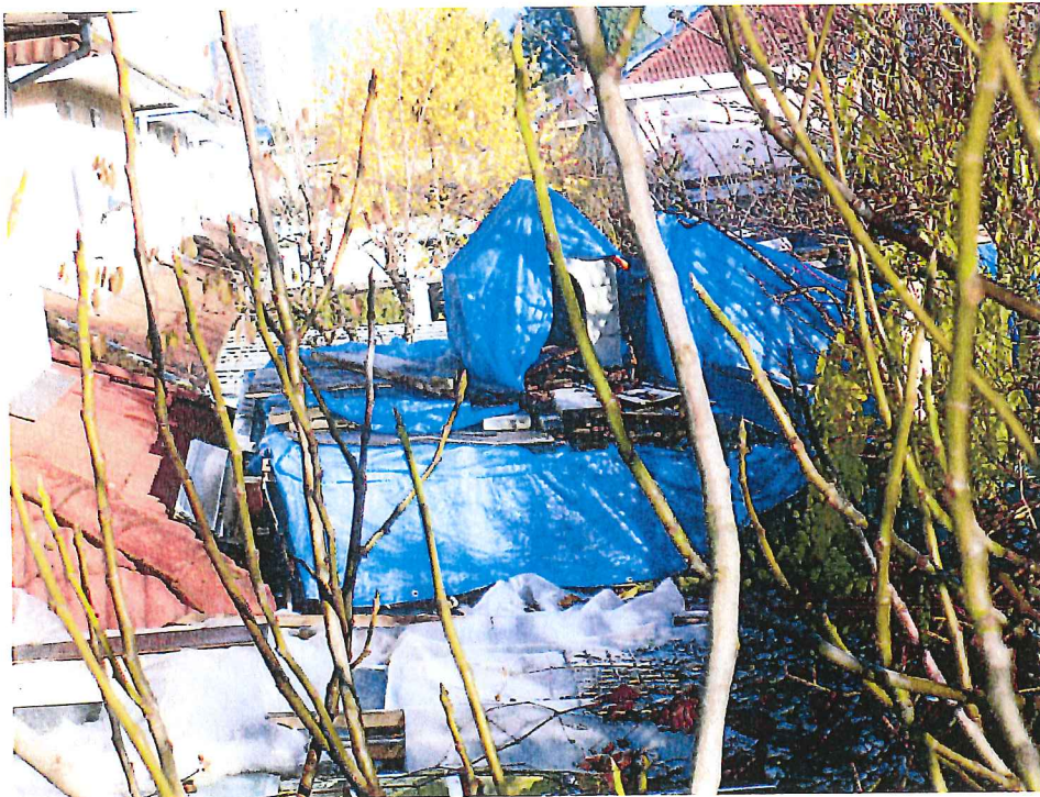
Photos from neighbouring house looking onto 4640 Carter Drive, from her child's bedroom.