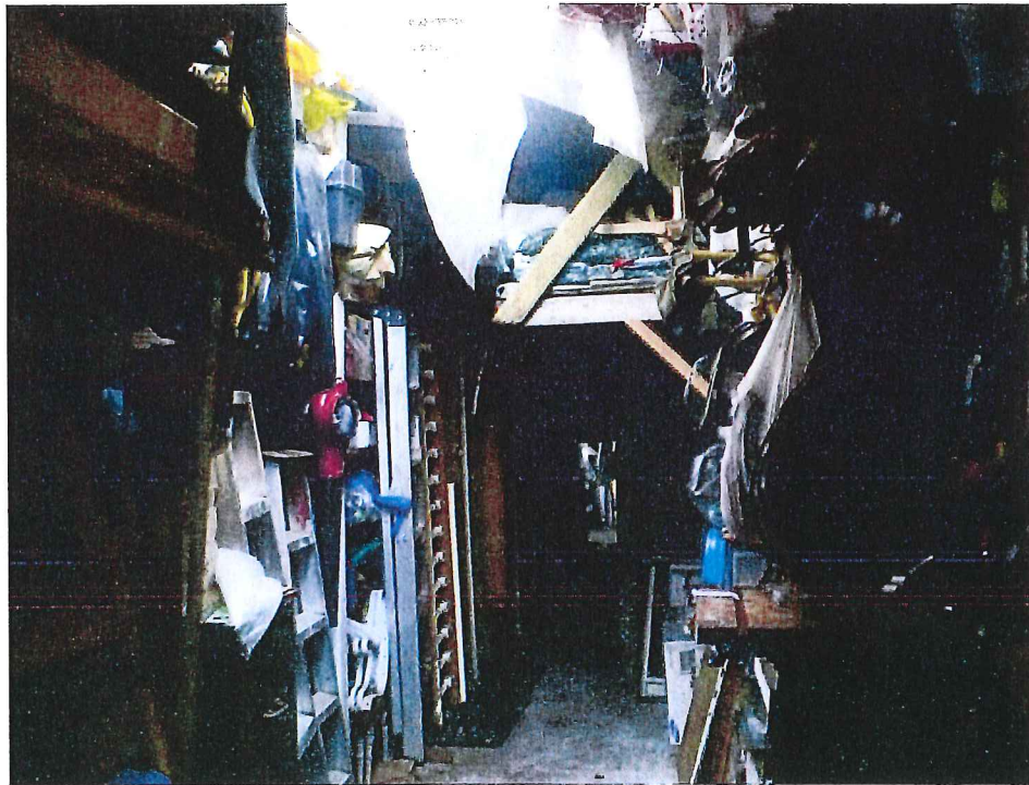
Above photos show a structure along the whole south side of the property, leaning against the neighbours' fence.

4640 Carter Dr – November 26, 2012