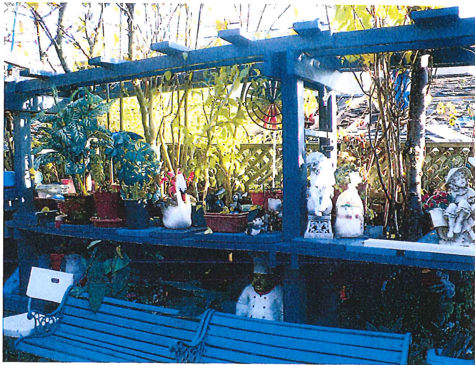
Above photo looking at the neighbours property to the east 4640 Carter Dr – November 26, 2012