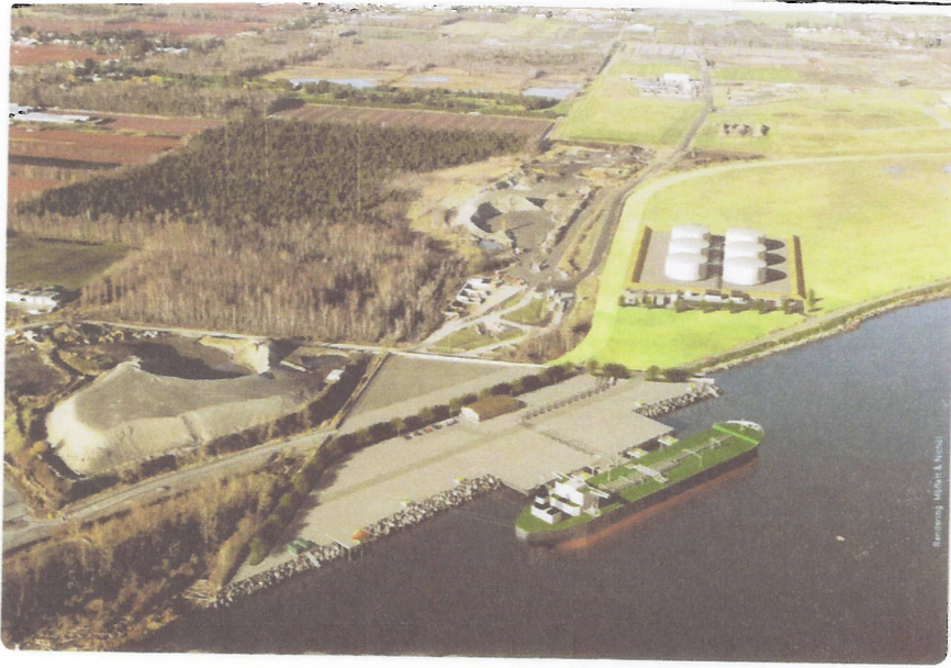
Refinery, Midwest, 1998