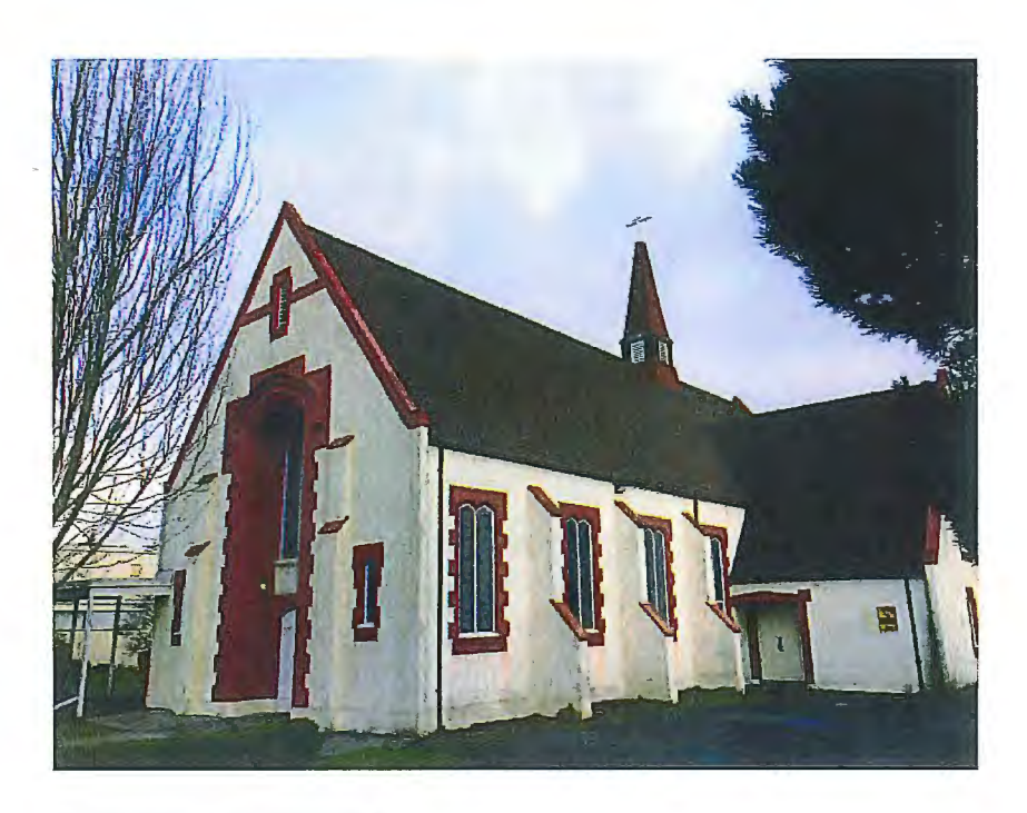
St Albans Anglican Church