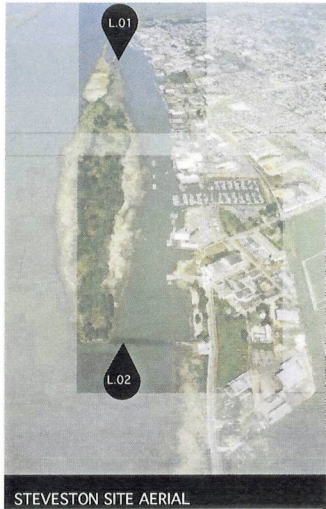
STEVESTON SITE AERIAL