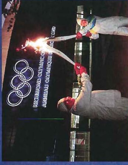
RICHMOND OLYMPIC OVAL