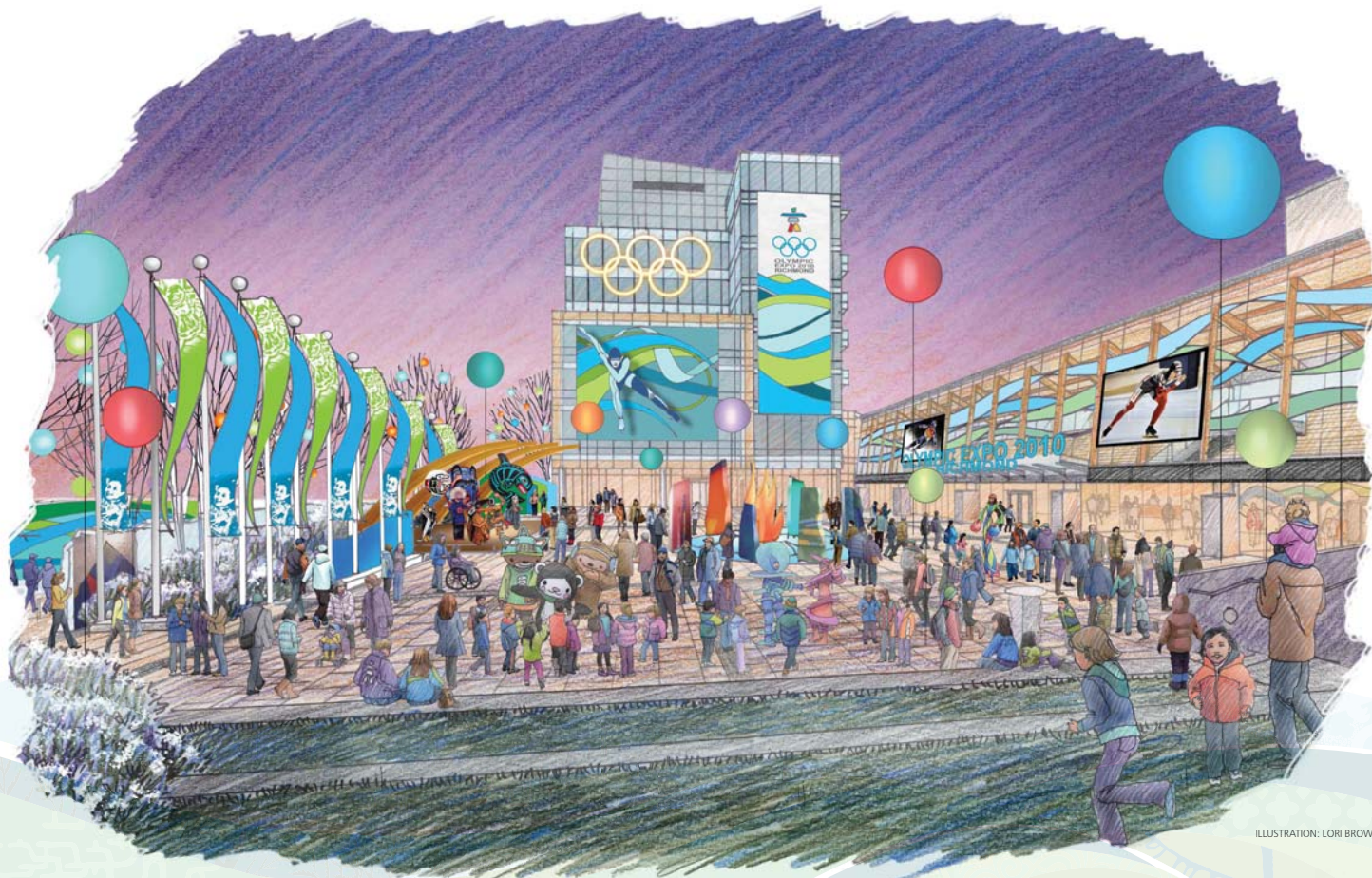
ILLUSTRATION: LORI BROWN

In the animated Outdoor Plaza, the glass facade of the main hall will offer a glimpse of what's inside, and entice visitors to enter. Those in queues will be kept entertained by jumbo screens showing Olympic activity and roving performers. Located at the main entrance to the O Zone , the Plaza overlooks the Ice Gate, a temporary ice installation by world renowned artist Gordon Halloran.