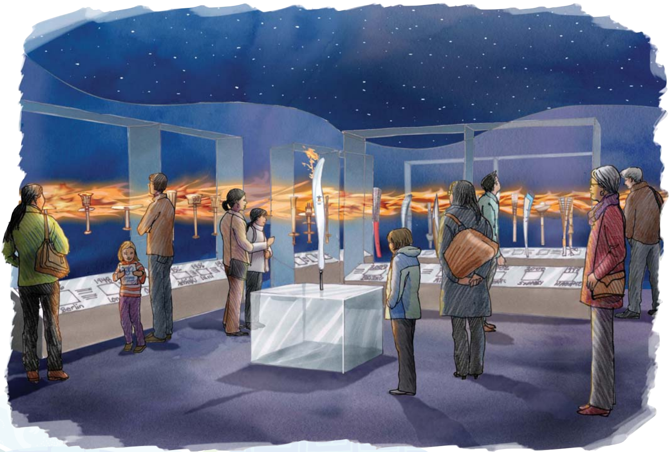
ILLUSTRATION: LORI BROWN

In the Torch room, visitors will also discover contemplative spaces to view rare collectors' items a "jewel box" atmosphere.