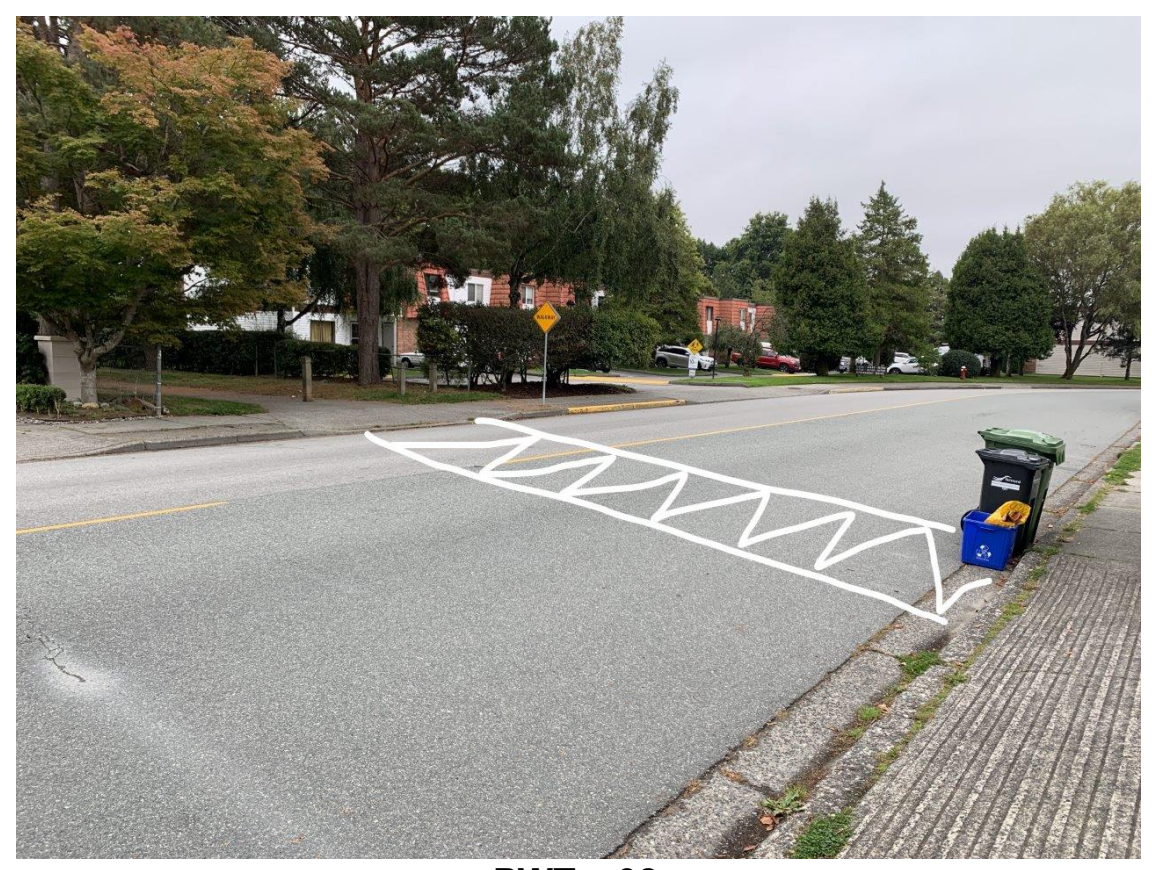
PWT - 98