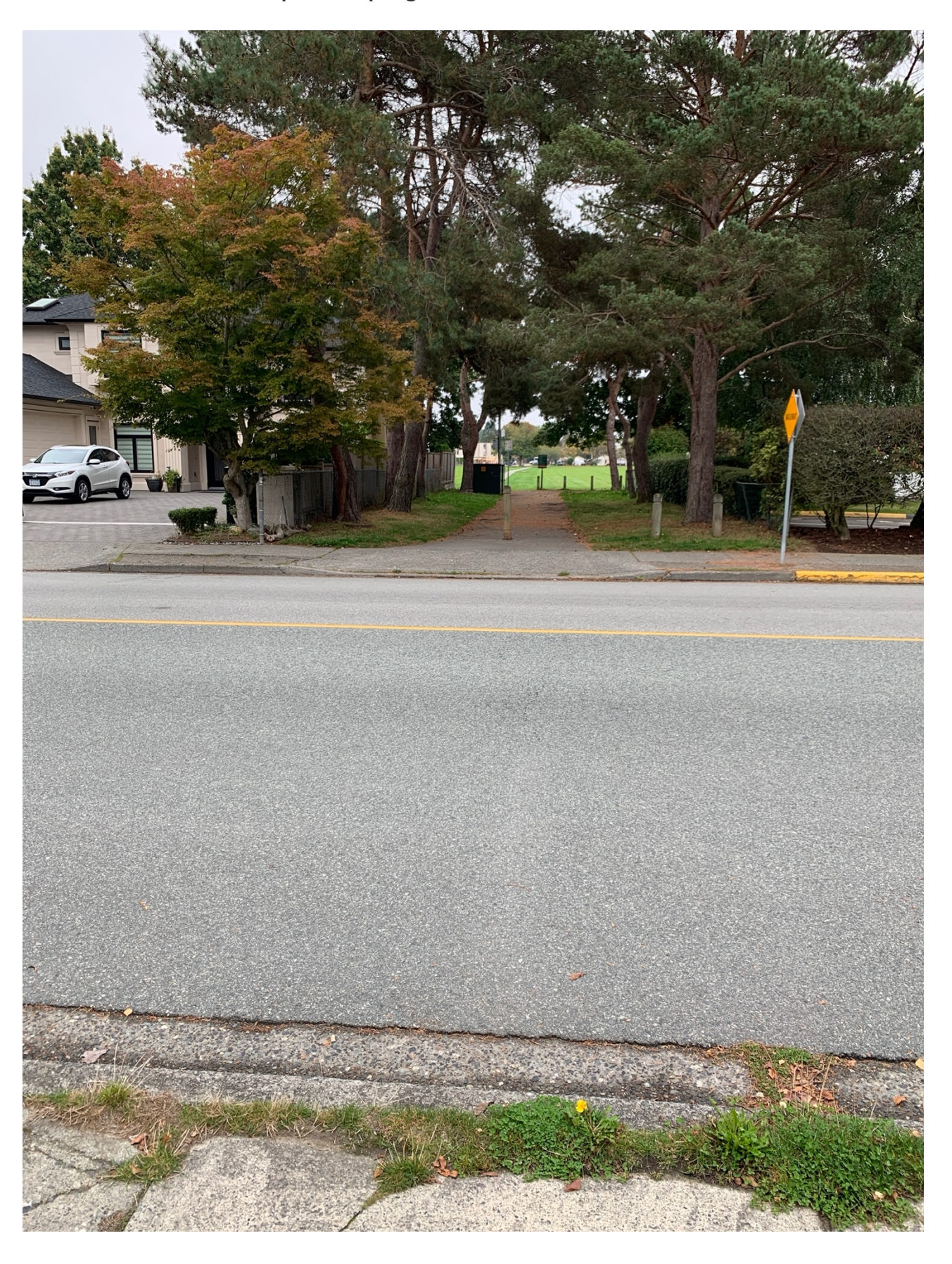
Current access to Manoah Steves park on Springmont Dr. No crosswalk.