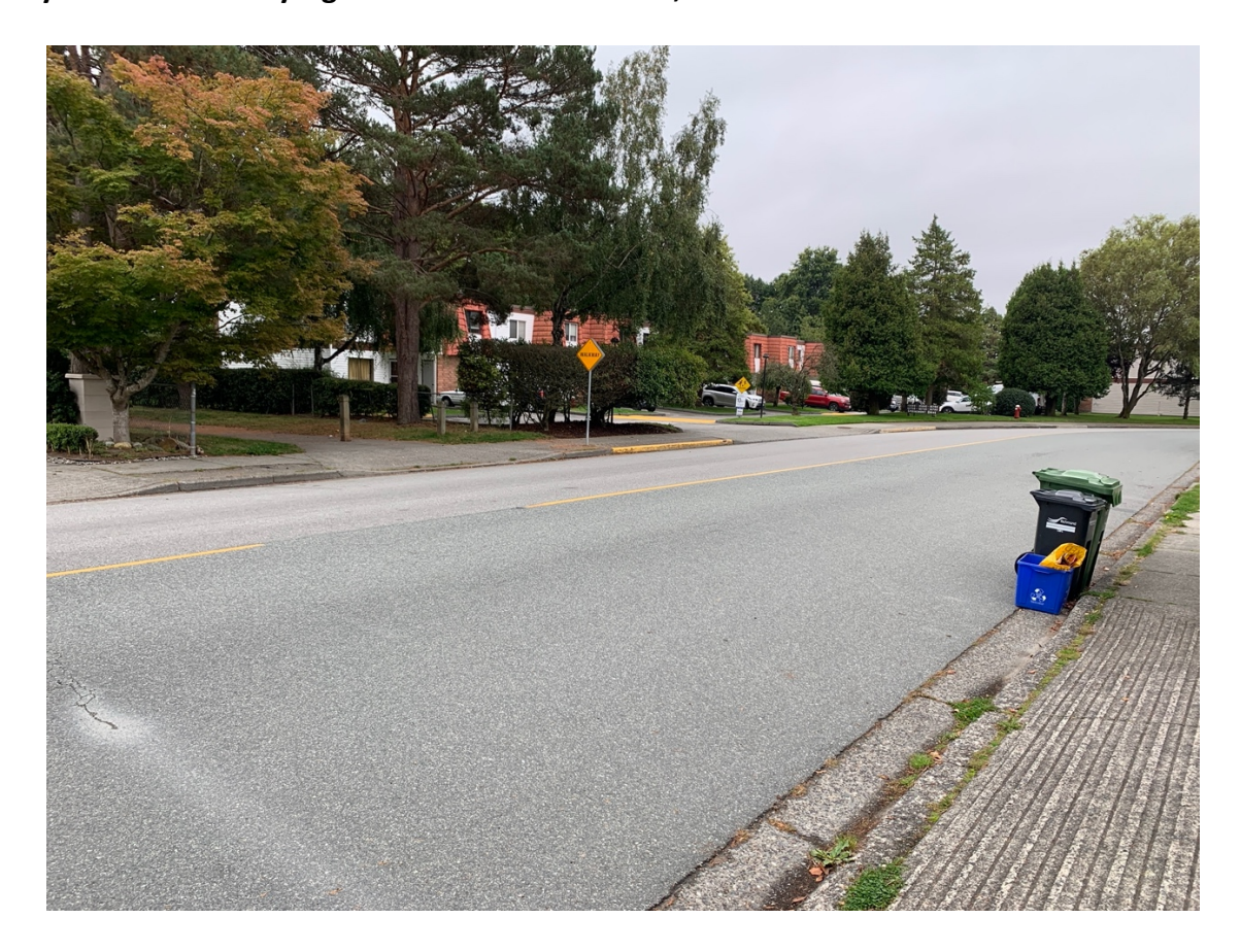
I propose adding a painted crosswalk and some crosswalk signs.

There is only a small Walkway sign on the side of the road, but no crosswalk.