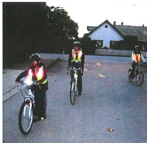
Figure 5: Participants in Learn to Ride Course

Learn to Ride: In October 2013, a beginner's course targeted to new Canadians (both adults and their children) was offered in co-operation with Richmond Family Place. The workshop takes participants through the most common situations faced when riding a bike in traffic and provides tips to make cycling commuting a fun and regular activity (see Figure 5). Two separate lessons were held with bicycles provided for those that needed them. A total of 16 participants attended over two instructional days including three adults were learning to ride and nine youth who joined with their parents. Feedback from participants was very positive.