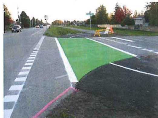
Figure 1: Railway Greenway crossing at Princeton Ave

Parkside Neighbourhood Link (Phase 1): Upgrade (i.e., widening and paving) of the existing off-street multi-use pathway along the perimeter of Walter Lee Elementary School (including addition of a new accessible ramp at Glenacres Dr) to safely accommodate two-way cycling, rolling and walking as part of Phase 1 of this second neighbourhood bike route that connects the South Arm area (Williams Road at Ash Street) to Garden City Park (see Figure 2).