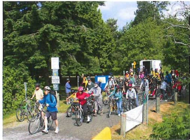
Figure 4: 2013 Bike Tour Participants

13 th Annual “Island City, by Bike” Tour (June 9, 2013) : Each year in June, as part of regional Bike Month activities and the City’s Environment Week events, the Committee and the City jointly stage guided tours for the community of some of the city’s cycling routes. The 13 th annual “Island City, by Bike” tour was based at Woodward’s Landing and offered short (7-km) and long (21-km) rides with escorts provided by volunteer members of the Richmond RCMP bike squad. The loops featured the South Dyke Trail and the recently completed cycling connection through Riverside Industrial Park that links Shell Road to Rice Mill Road. Activities included a bike and helmet safety check prior to the ride plus a barbecue lunch and raffle prize draw at the finish. Despite rain that morning, the event attracted 94 cyclists of all ages and cycling ability (see Figure 4). Attendance at the event has consistently grown over the past several years and now averages 110 participants, up from 75 in the first five years of the event.