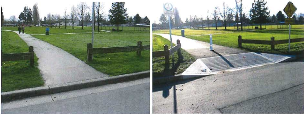
Figure 2: Before & After Off-Street Path along Perimeter of Walter Lee School

Westminster Highway Pathway (No. 6 Road-No. 8 Road) : Removal of centre bollards from the existing off-street pathway and review of further potential improvements including the addition of new streetlights, painted white edge lines and reflectors to improve visibility and the legibility of the pathway at night.