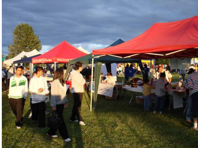
Hamilton (Community Association) Festival (2007)

Venue: Hamilton (Community Association) Festival McLean Park (McLean Ave at Westminster Hwy) Richmond