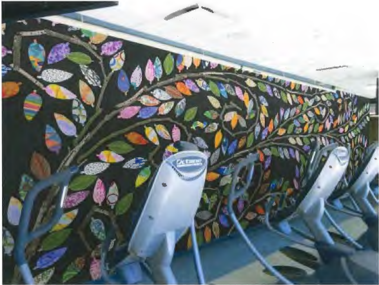
Figure 1. Artist rendering of digitally composed photographic mural in Fitness Centre.