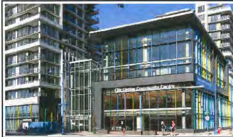
Figure 1. City Centre Community Centre, 5900 Minoru Boulevard, Richmond, BC.