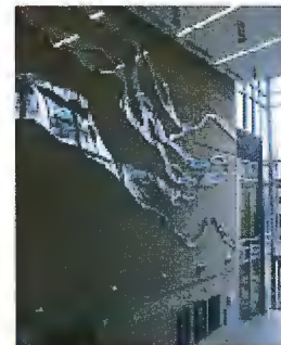
Figure 3 – Ebb and Flow , J. Metz and N. Chew, 2015.