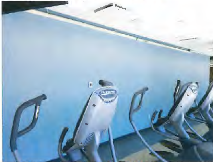
Figure 6 – Approximate dimensions of the wall: 8 ft. high x 25 ft. length