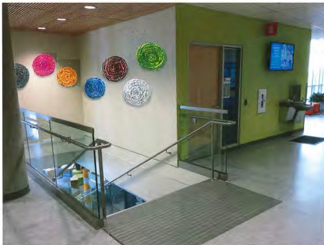
Figure 1. Artist rendering of concept proposal for Stepping Stones .