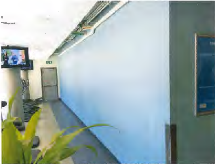
Figure 5 – approximate dimensions of the wall: 8 ft. high x 25 ft. length