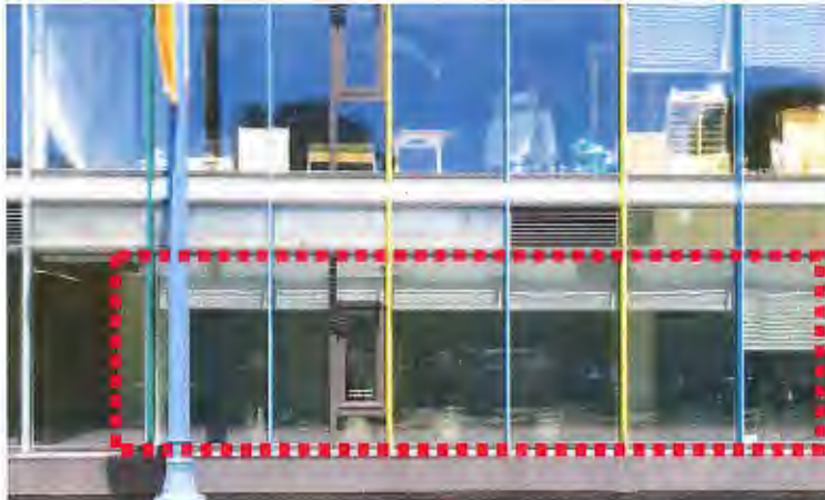
Figure 8 – Passersby on Firbridge Way will be able to see the artwork through the glass façade highlighted.