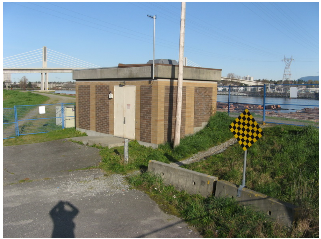
Original Pump Station