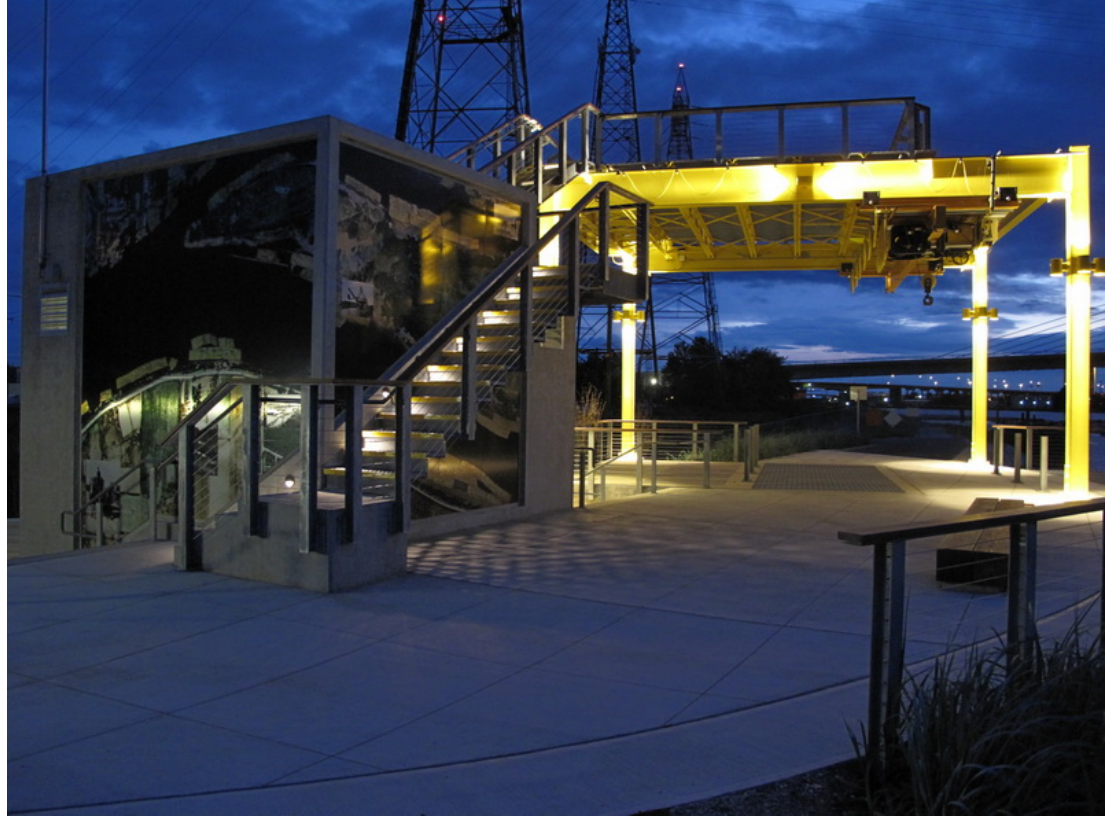
Completed Pump Station