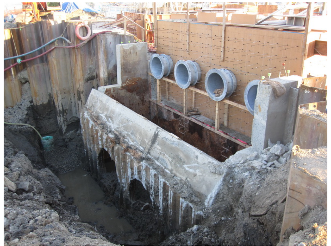
Flood Box Demolition/Construction