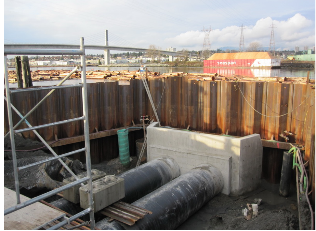
Gravity Discharge Pipes and Headwall