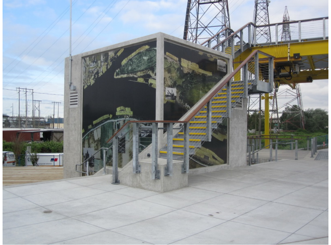
Public Art on the Control Building

The No. 4 Road Drainage Pump Station is located on the popular, highly utilized Fraser River Middle Arm dike/trail system. This pump station site is also immediately adjacent to a current major residential development. The existing pump station area was very basic from a public trail and pump station access viewpoint – this area was transformed into a significant architectural feature with a large public plaza viewing area offering spectacular views associated with the Fraser River Middle Arm and all its amenities.