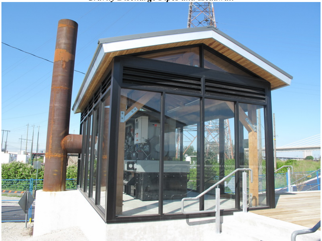
Completed Back-up Generator Building