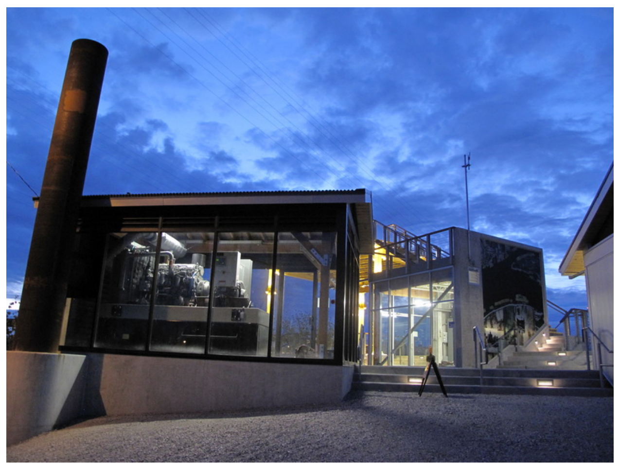
Completed Pump Station- Back-up Generator Building (Left) and Control Building (Right)

Fundamental to the City of Richmond's ability to provide flood protection service is a world class system of dikes, gravity mainlines, ditches/canals/sloughs and drainage pump stations. Existing and considerable planned growth in the West Cambie area following Canada Line construction and the 2010 Winter Olympics has resulted in the need to upgrade existing flood protection system capacities.