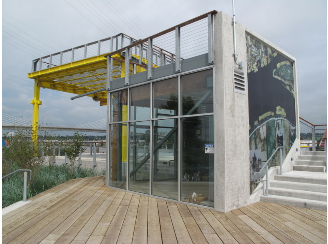
Completed Gantry Crane and Control Building and Public Art