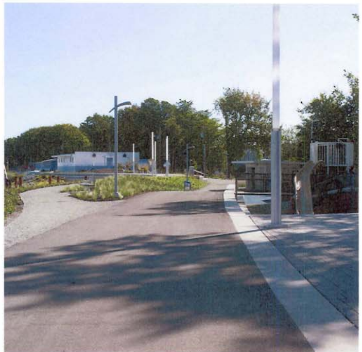
Greenway view to east from UBC Boathouse