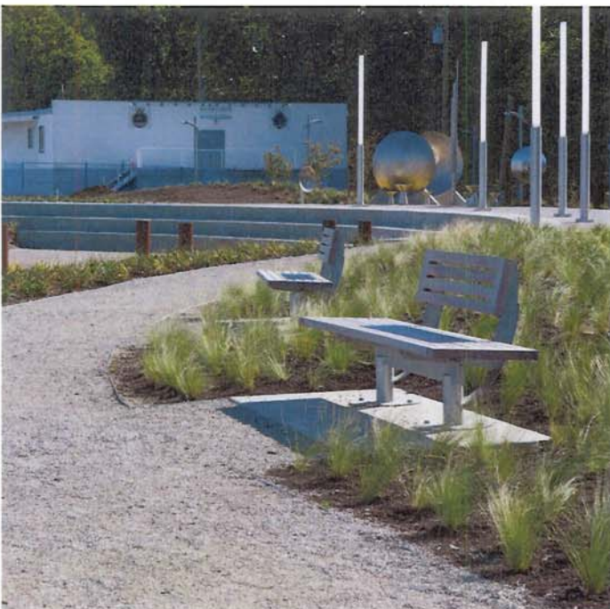
New benches and plantings