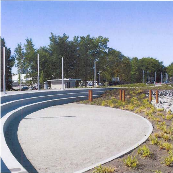
Amphitheatre and new plantings