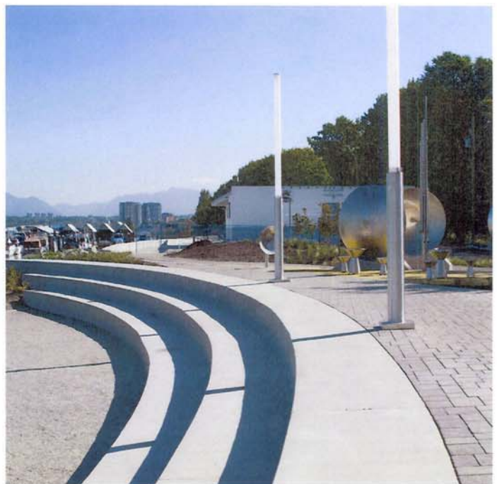
View of Amphitheatre and Sound Garden