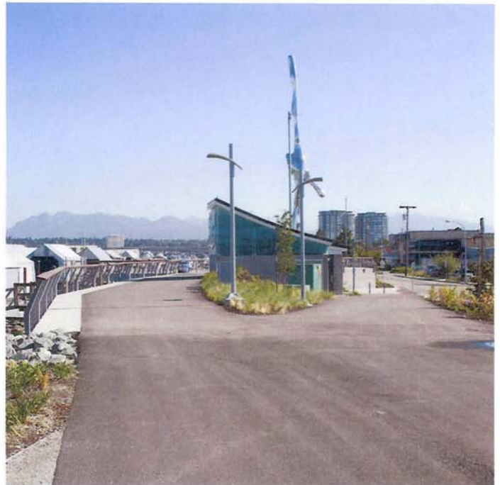
View east towards Cambie Plaza