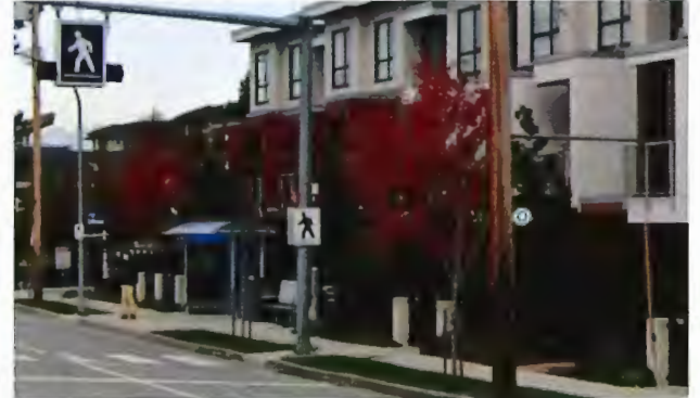
Figure 1: Before - Older Design with Utility Strip and 1.5m Sidewalk