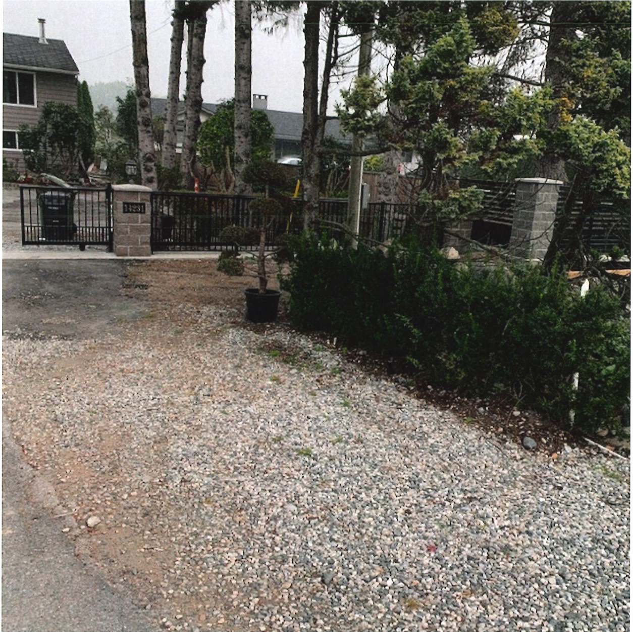
Attachment: Neighbours Picture 2