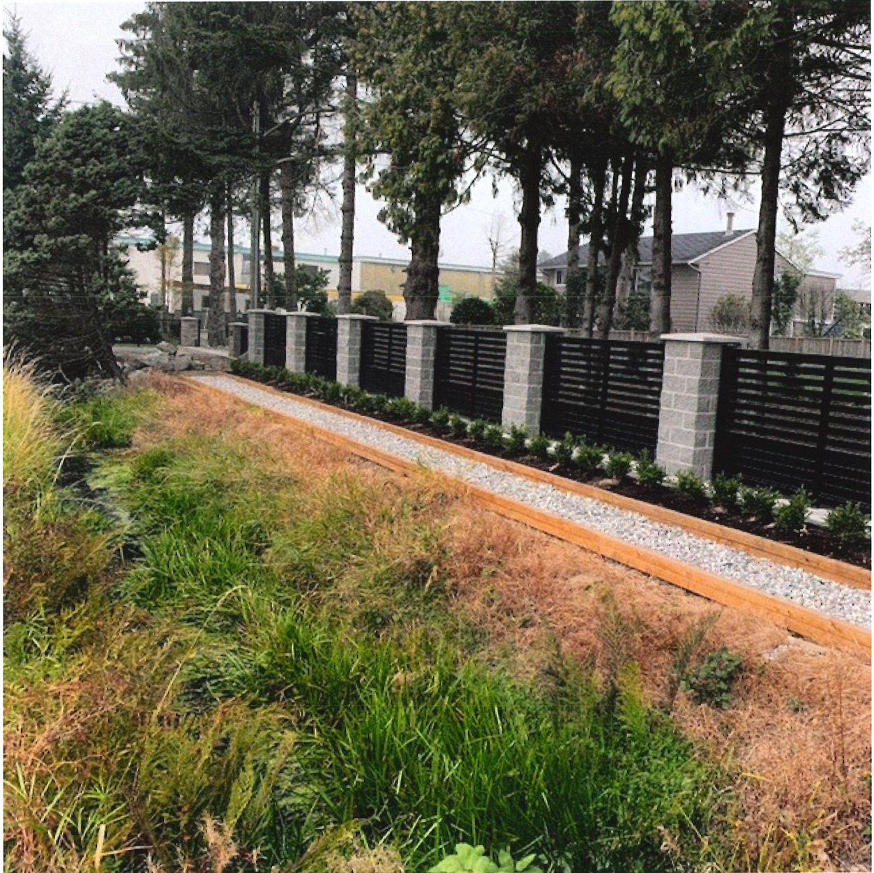
Attachment: Neighbours Similar House