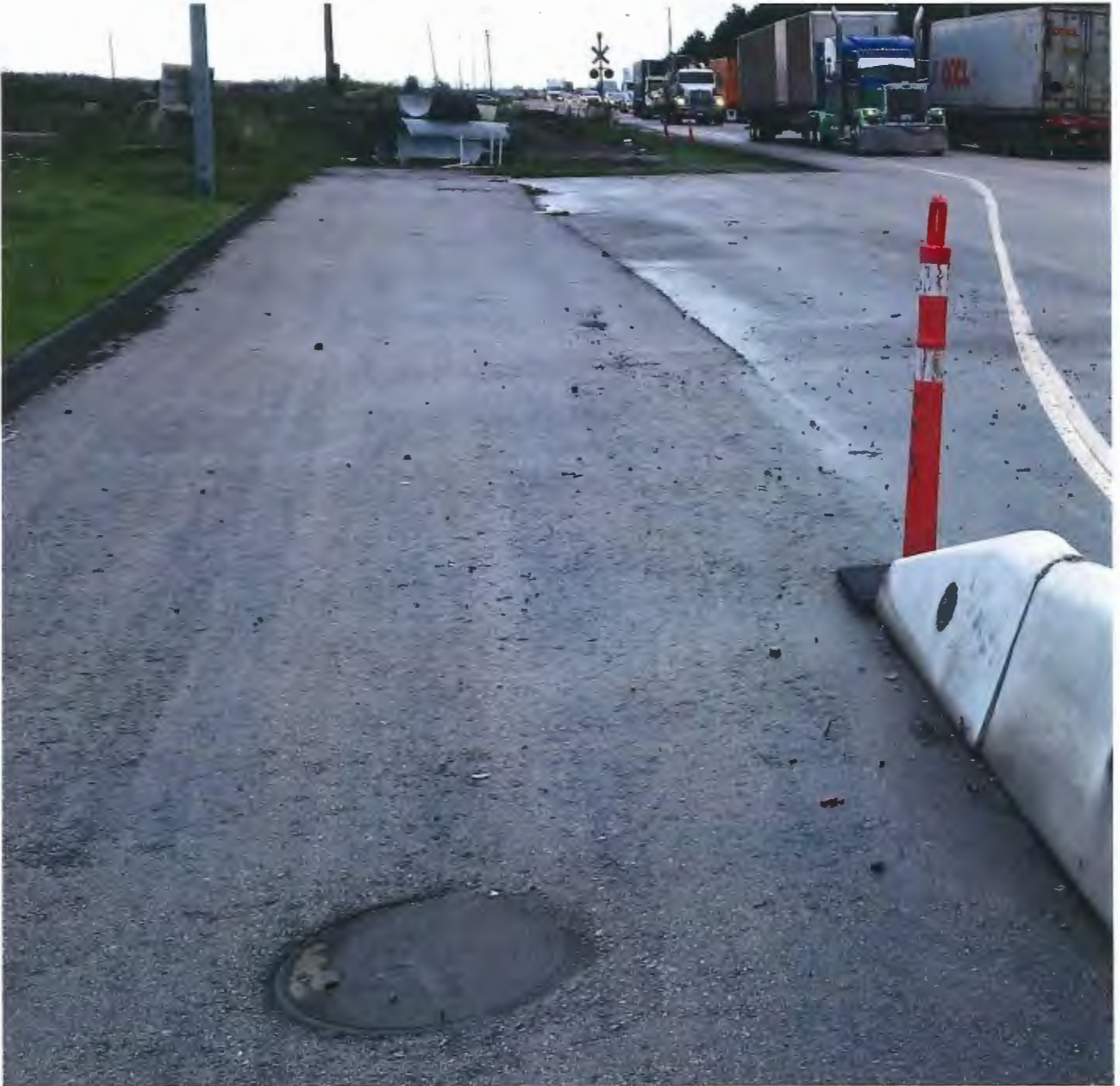
Piecemeal cycling routes can do more harm than good, say cyclists