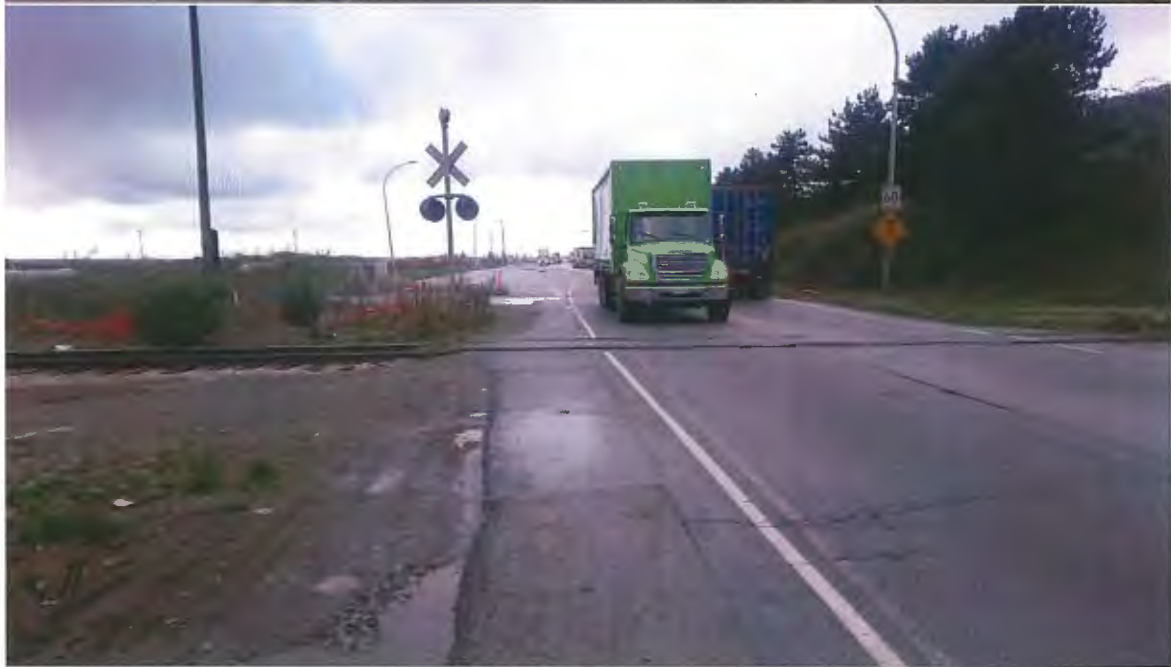
Russ Baker Way