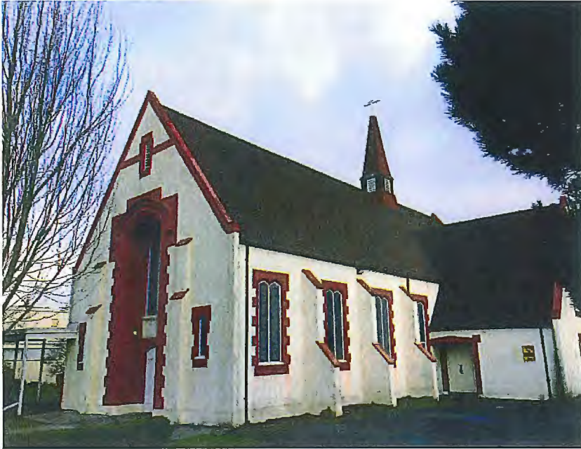
St Albans Anglican Church