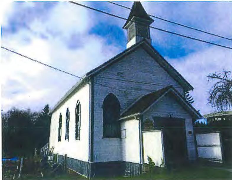
South Arm United Historic Church

Church rental and custodian only $ 350 to $ 400