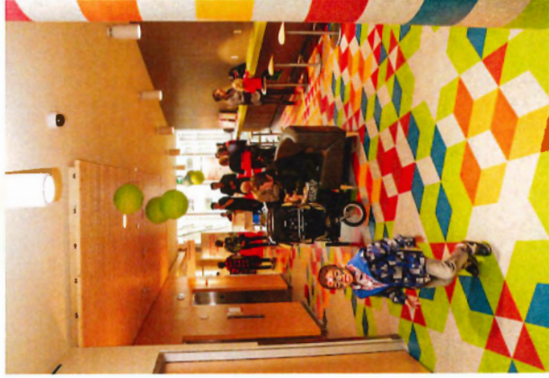
New and Improved Spaces