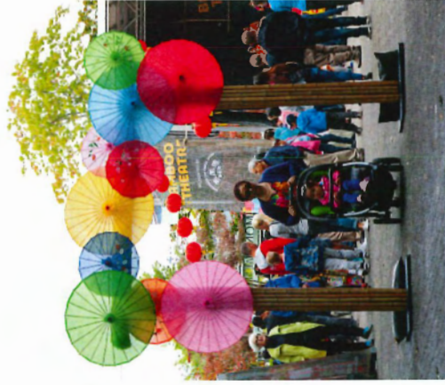
Free Public Events