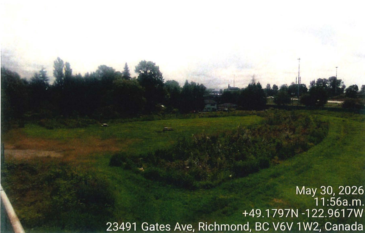
May 30, 2026 11:56a.m. +49.1797N -122.9617W 23491 Gates Ave, Richmond, BC V6V 1W2, Canada