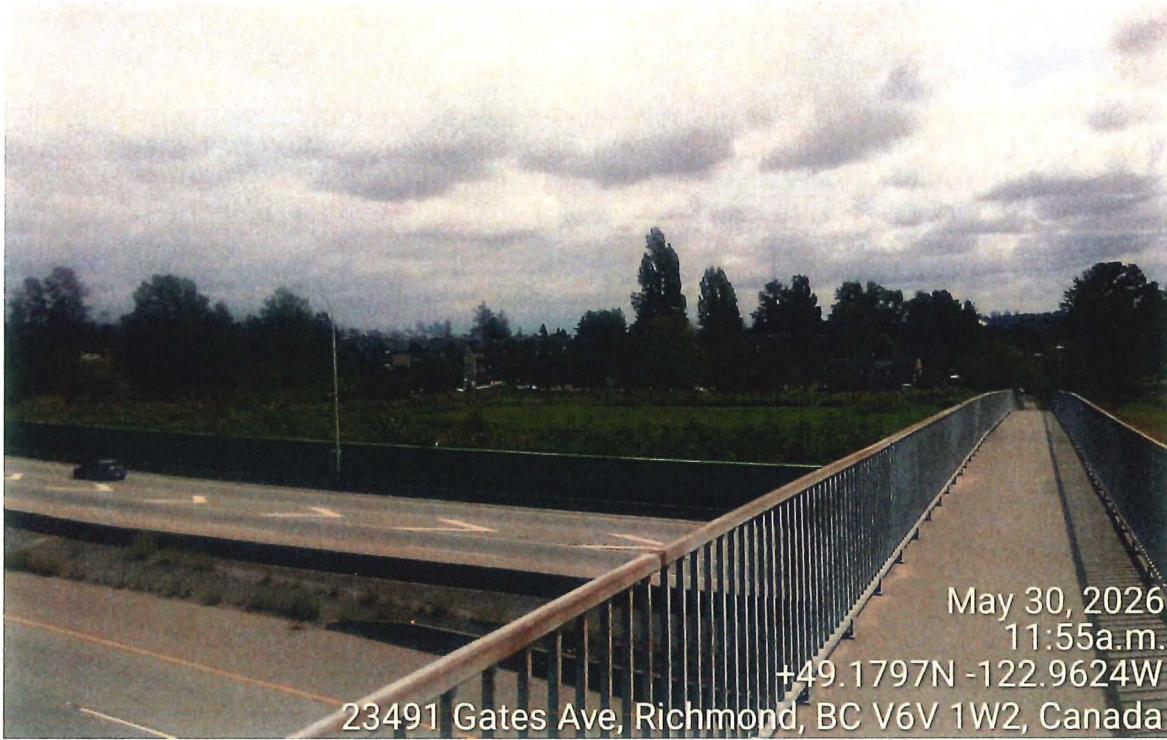
May 30, 2026 11:55a.m. +49.1797N -122.9624W 23491 Gates Ave, Richmond, BC V6V 1W2, Canada