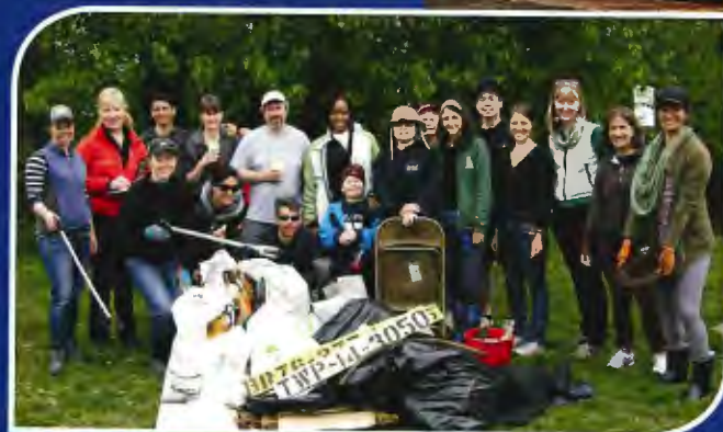
Fraser River Park clean-up day for FBC's Vancouver office staff and other members of the community