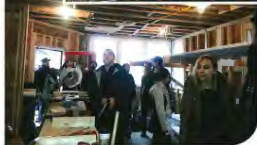
Top: A First Nations Home EnergySave workshop in January 2016 at Musqueam First Nation Cultural Centre brought together housing managers, senior staff and elected leaders to discuss priority actions for energy efficiency in renovation and new construction, as well as to share successes and explore financing options.