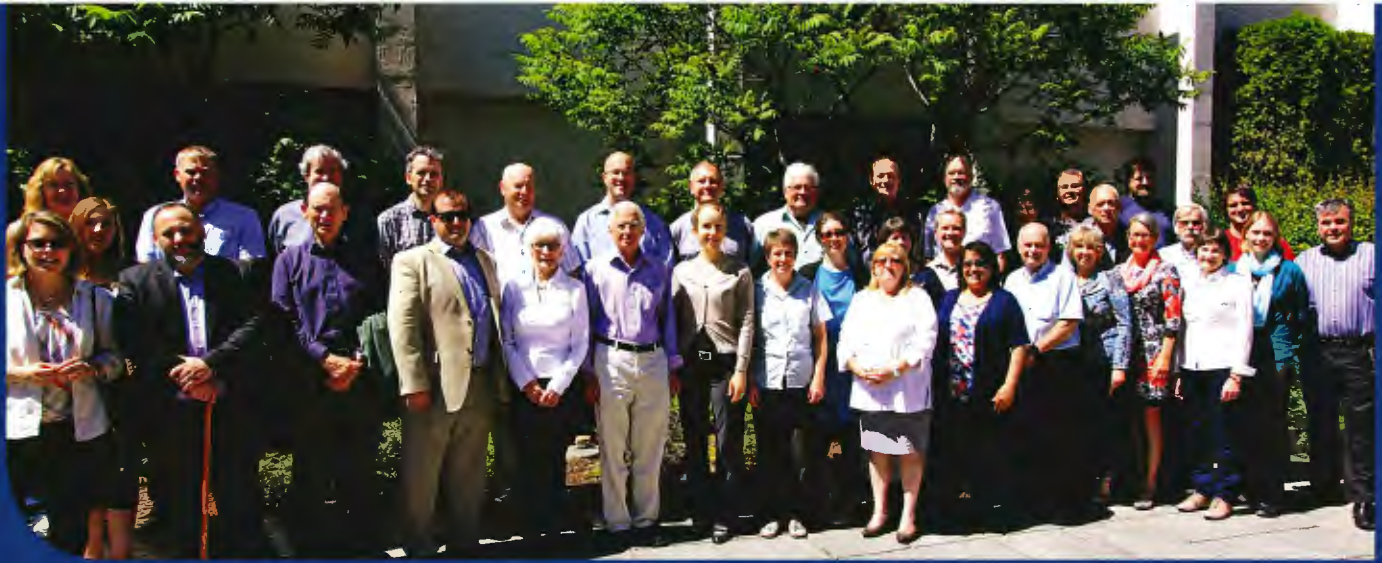
FBC Board of Directors with FBC staff and special guests at the June 2015 board meeting