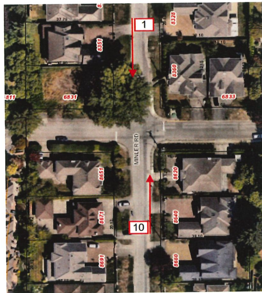
Figure 2: Number of Pedestrians on Minler Road