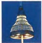
Finial and Light

Minoru Complex occupies an important position in the cultural precinct and is an active site for local residents. Many types of activities are present here for a variety of age groups that provide the framework for a rich tradition of creating lasting memories and celebrations for Richmond residents. The east entry plaza is the location for the artwork, a new cultural artifact.