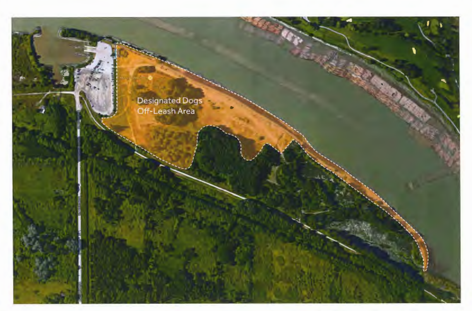
McDonald Beach Park