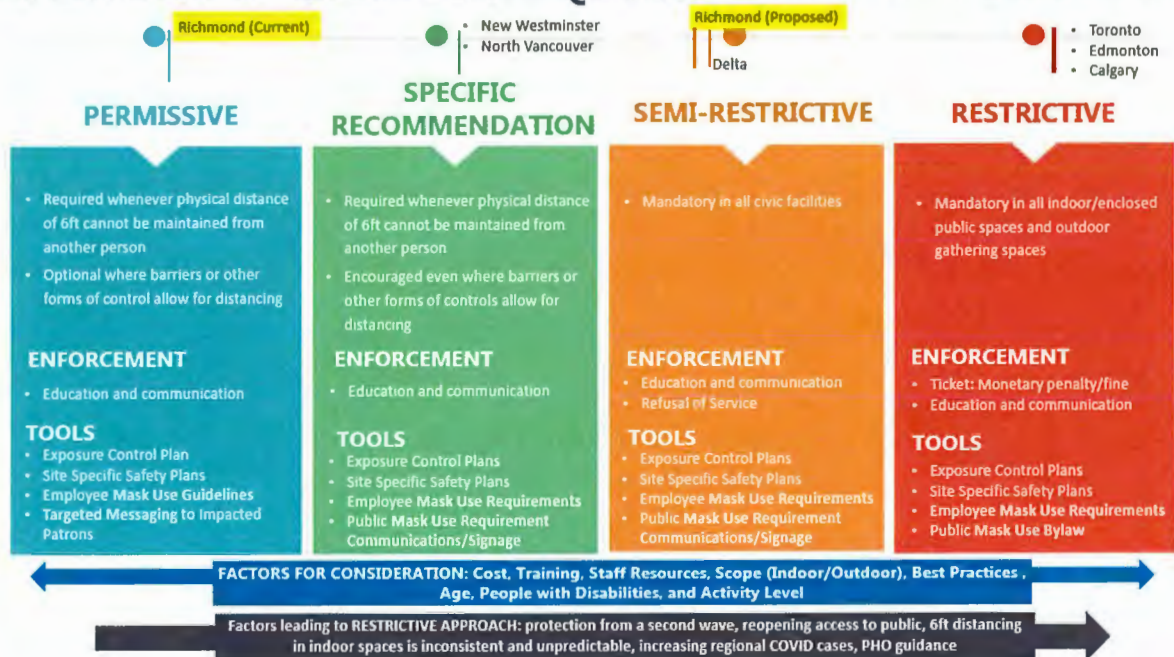
Illustration 1: Spectrum of Mask Use Requirements in City Buildings

The City of Richmond's current practice is for employees whose job function requires the use of a mask according to the Hierarchy of Controls identified in the Pandemic Exposure Control Plan to be provided with an appropriate style of mask at the City's cost.