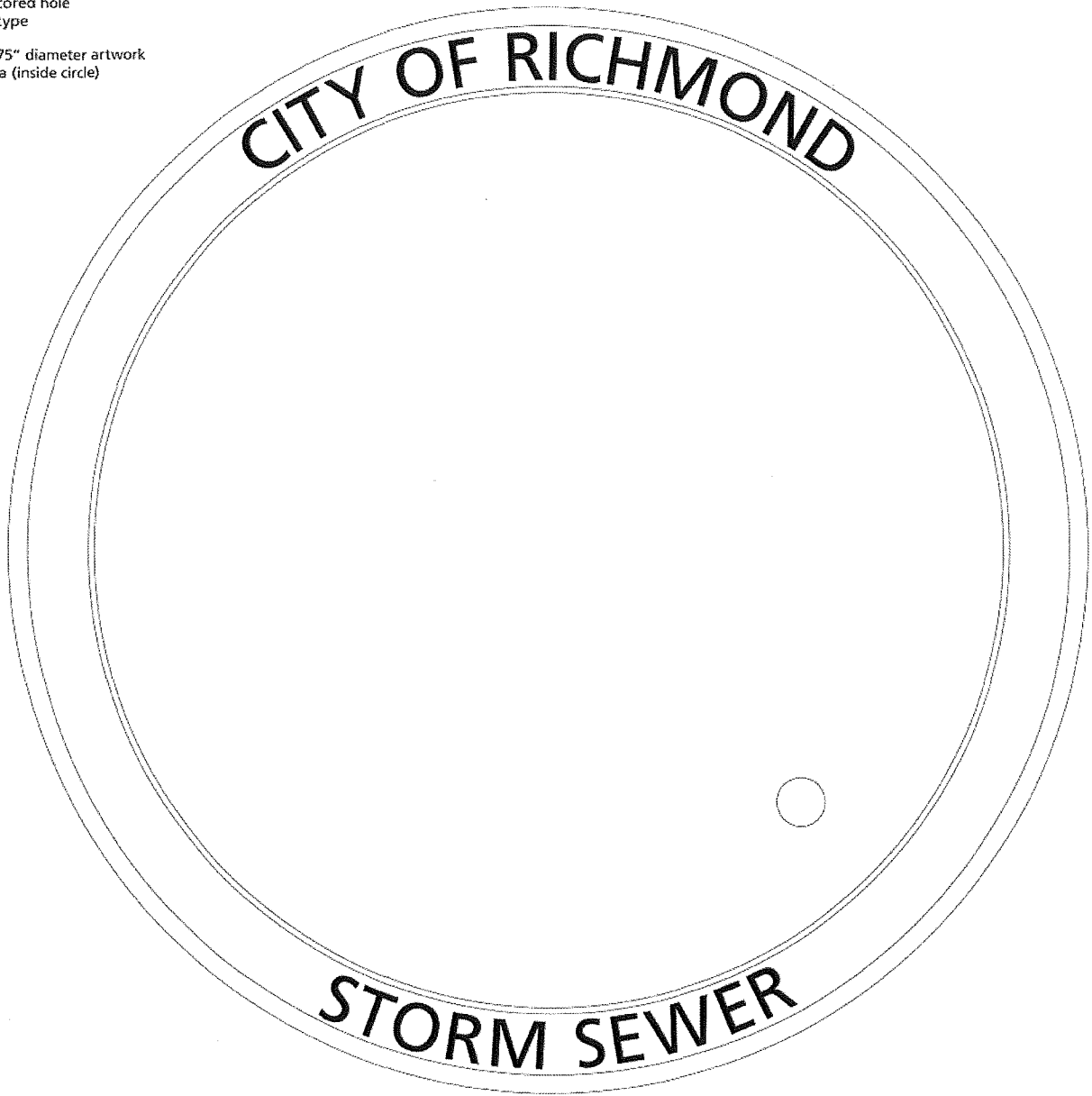
Figure 5. Artist Template

22.25" diameter cover 1" cored hole 1" type 18.75" diameter artwork area (inside circle)