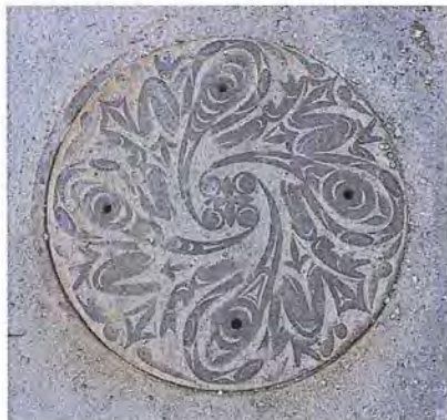
Figure 2. Susan Point, Vancouver. (2004)