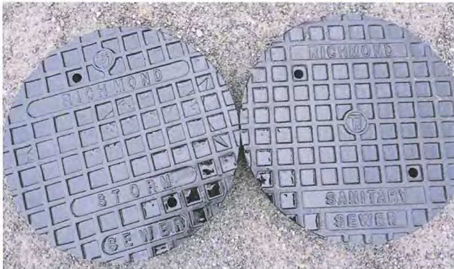
Figure 1. - Existing Richmond Sanitary and Storm Manhole Covers

Thousands of manhole covers are located throughout the city but they tend to get lost in the urban landscape mix. This is your chance to help turn these ordinary cast-iron lids into works of art. Put your pencil to paper and create a design that could be showcased on Richmond's streets for a lifetime.