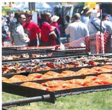
From the colourful and quirky characters at the Richmond Maritime Festival to the scrumptious, sizzling salmon barbecue at the Steveston Salmon Festival, Richmond's Days of Summer are full of treats for all senses.