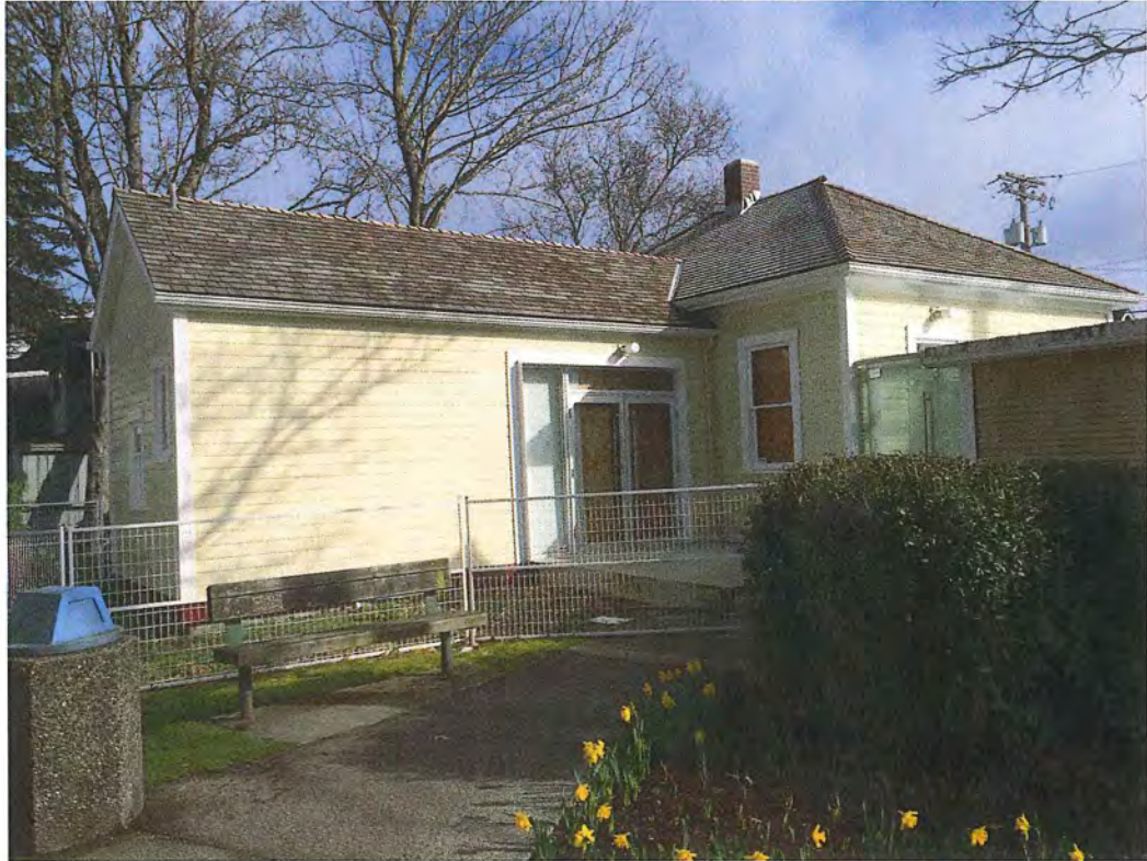
Building – South Elevation View