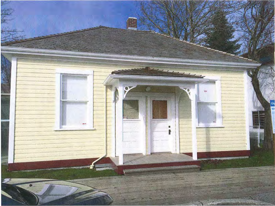
Building – East Elevation View