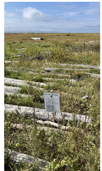
Spartina management area

years of no observed regrowth of a historic Brazilian elodea infestation site