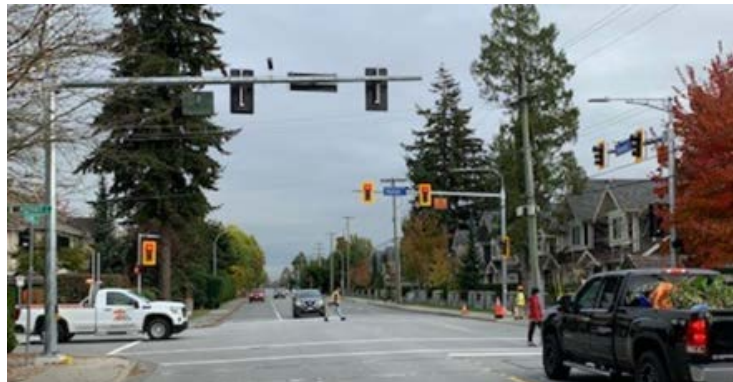
Figure 1: Upgrade of Pedestrian Signal at Blundell Road-Moffat Road to Full Signal

Over the past five years, ICBC has contributed a total of $1,227,390 towards the City’s transportation projects (Figure 2).