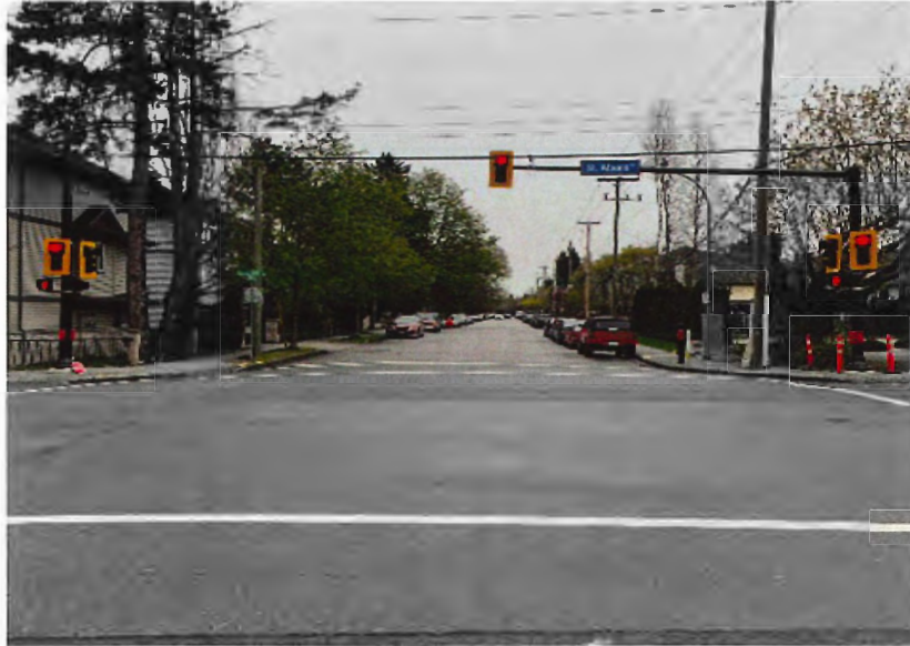
Figure 1: Installation of a New Traffic Signal at St. Albans Road and Bennett Road

Projects include the installation of traffic signals, special crosswalks, overhead LED street name signs and pedestrian and cycling improvements. Figure 1 shows the installation of a traffic signal that received funding through the 2023 ICBC Road Improvement Program.