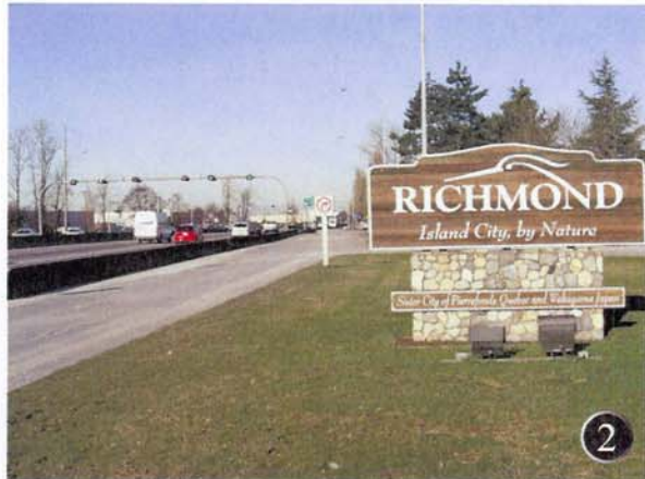
Highway 99 | North end Tunnel and Steveston Hwy. exit