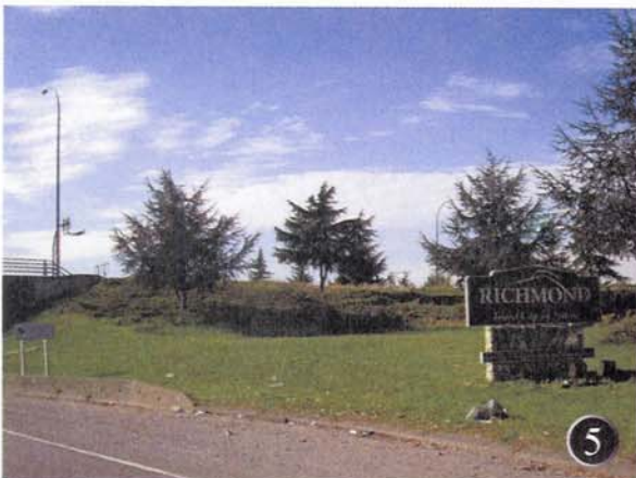
Knight Street Bridge/Hwy. 99 | Bridgeport Road exit