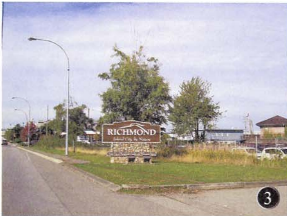
Sea Island Way | Oak Street Bridge exit