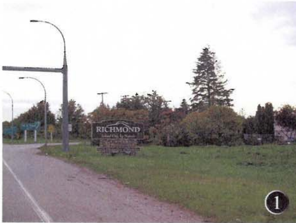
Highway 99 | No. 4 Road exit