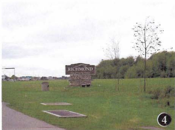
Russ Baker Way | Sea Island Firehall