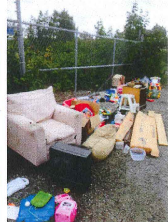
Ongoing illegal dumping around donation bins at Steveston Hwy and No. 3 Road (July 22, 2015)