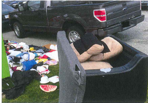
Ongoing illegal dumping around donation bins on Capstan Way just west of Garden City Road (June, 2015)