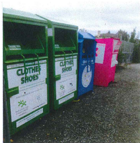
Steveston Hwy and No. 3 Road donation bin site after City litter staff cleaned up for one hour (July 22, 2015)