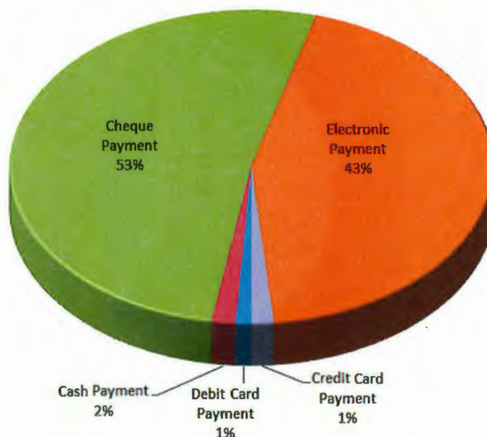
Breakdown of 2018 Collection by Payment Method

During 2018, the City collected and processed approximately $695 million in payments (data excludes recreational services). As shown in the chart below, 53% of the payments are accepted by cheque, 43% are paid by electronic payments (such as electronic bill payments, direct deposit payments, wire payments etc.), 2% are paid by cash, with the remaining 2% of the payments paid by debit cards or credit cards.