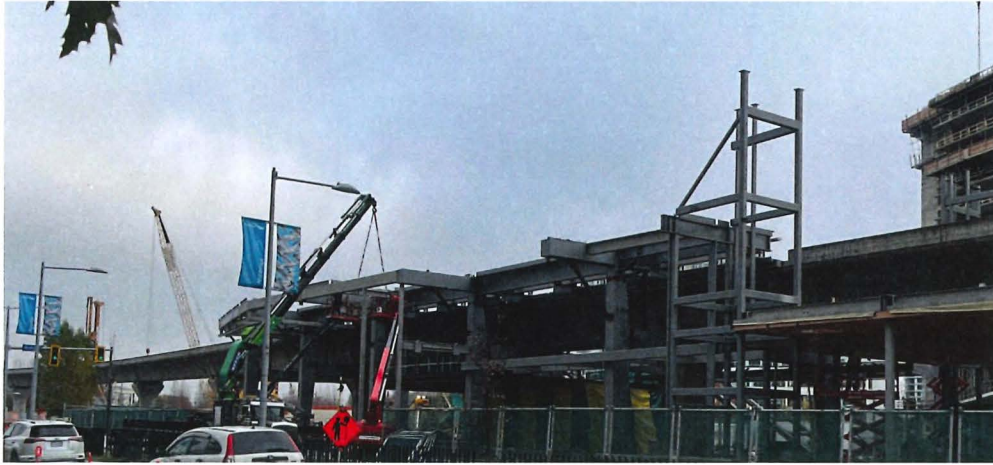
Figure 1: Capstan Station Construction

The construction of the structural steel at the concourse level of the future station is complete. The current phase of construction involves installing large pieces of steel for framing of the platform level (Figure 1).