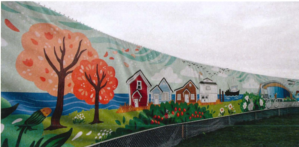
Figure 2: Artistic Construction Fence Wrap

TransLink has commissioned artwork incorporated into wraps designed by Richmond-based artists. The art wraps are installed on the construction hoarding fence around Capstan Station (Figure 2).