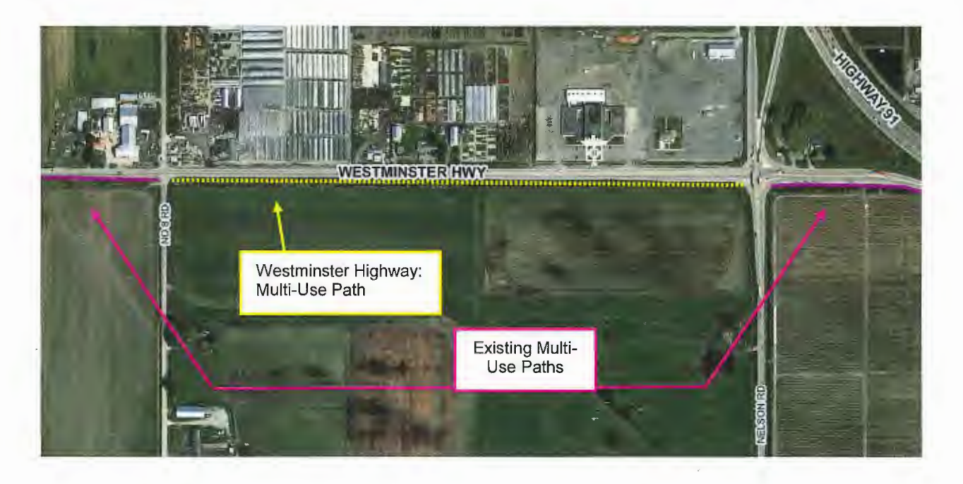
Proposed Projects shown in Yellow Outlined Boxes

Proposed Supplemental 2017 MRNB, BICCS Regional Needs and WITT Projects