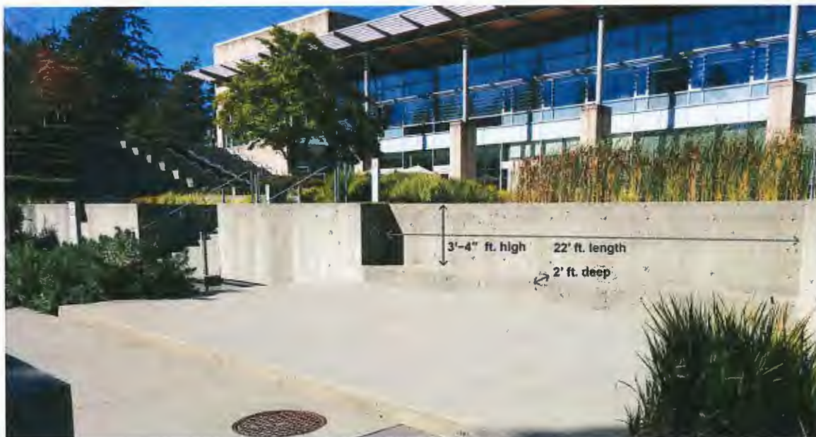
Figure 3 – Artwork dimensions should not exceed 22' length x 3'-4" high x 2' deep.