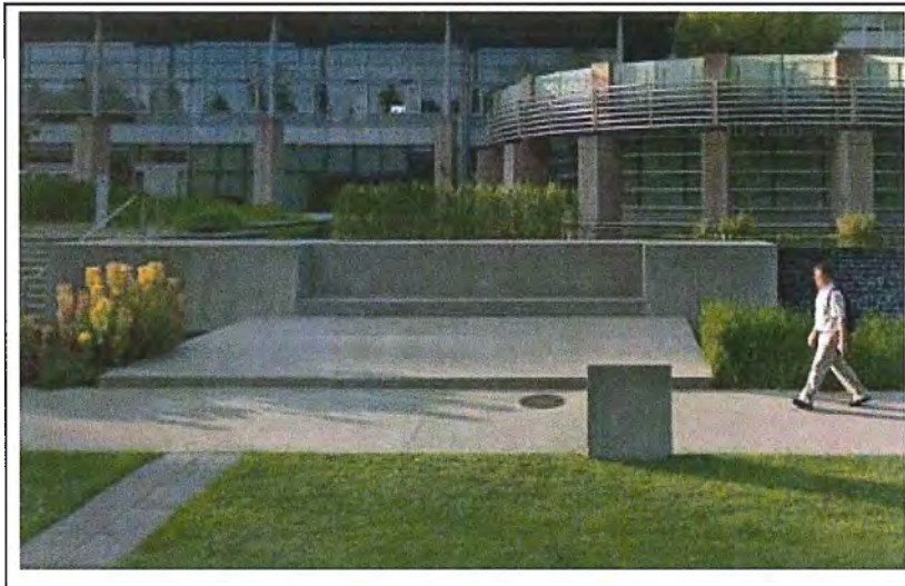
Figure 1 - Richmond City Hall, artwork location facing Granville Avenue.