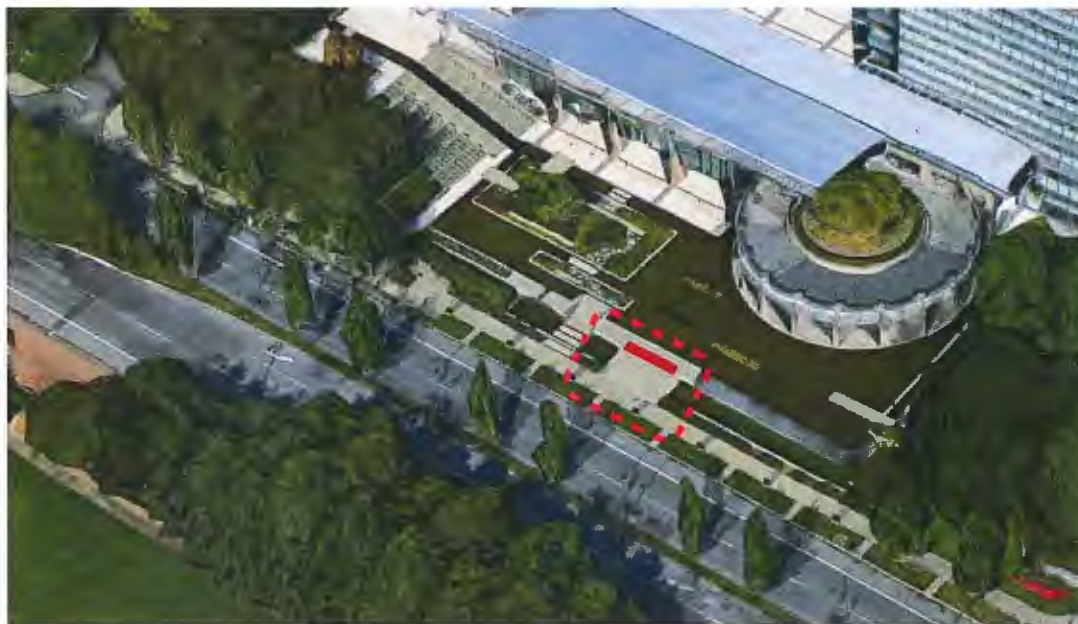
Figure 5 – Aerial perspective showing site in context along Granville Avenue.