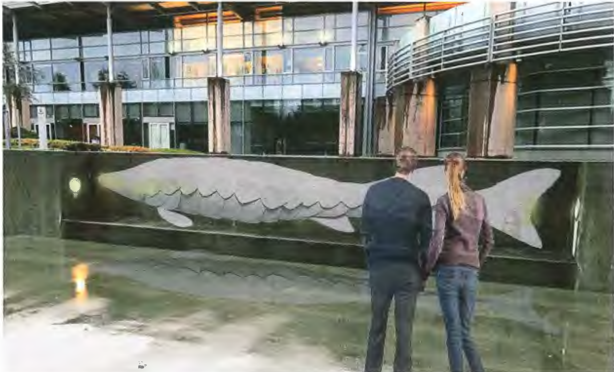
Figure 2 – Artist rendering of the white sturgeon artwork within the existing concrete recess