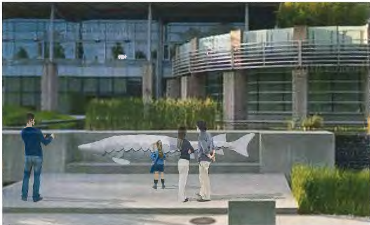
Figure 3 – Artist rendering of the white sturgeon in context with the site and architecture