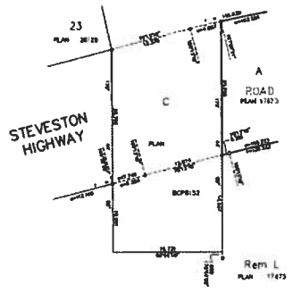
ENLARGEMENT "A" NOT TO SCALE

THE PLAN TO WHICH THIS REFERENCE PLAN RELATES IS PLAN 17473 SECTION 32 BLOCK 4 NORTH RANGE 5 WEST NEW WESTMINSTER DISTRICT.