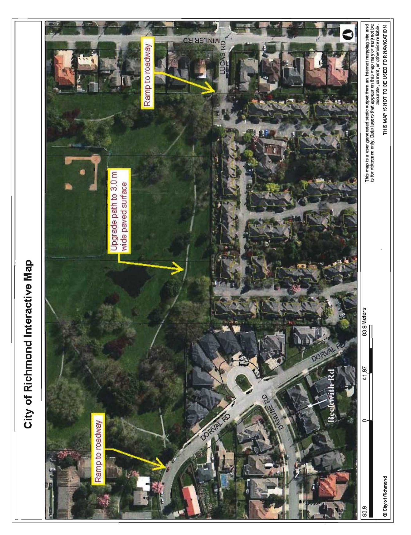
PWT - 43