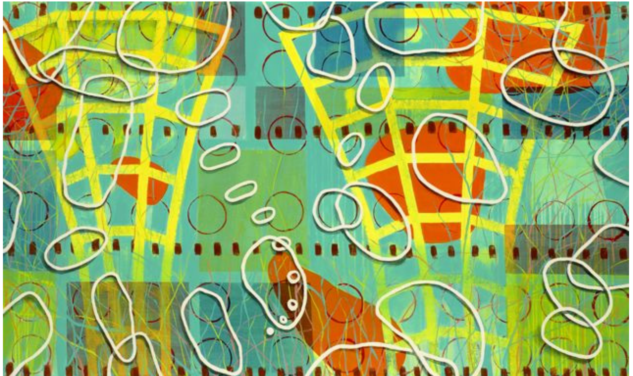
Nancy Halifax, The Passage of Time (detail), 2009, acrylic on canvas