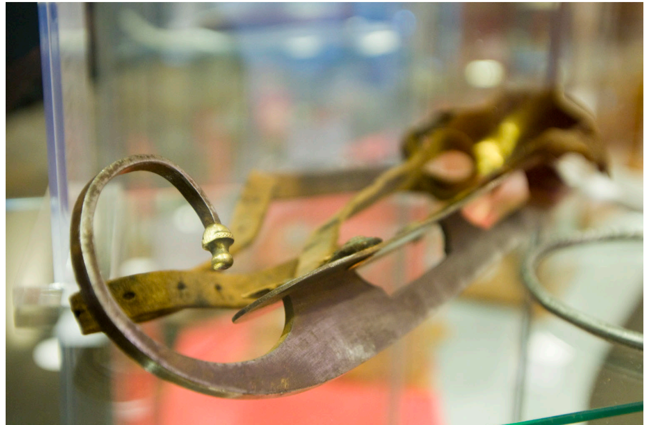
Speed Skating Canada Exhibit, Richmond O Zone

The City Hall exhibits were very well-received and the final 17-day attendance figure during the O Zone was 54,211 visitors.