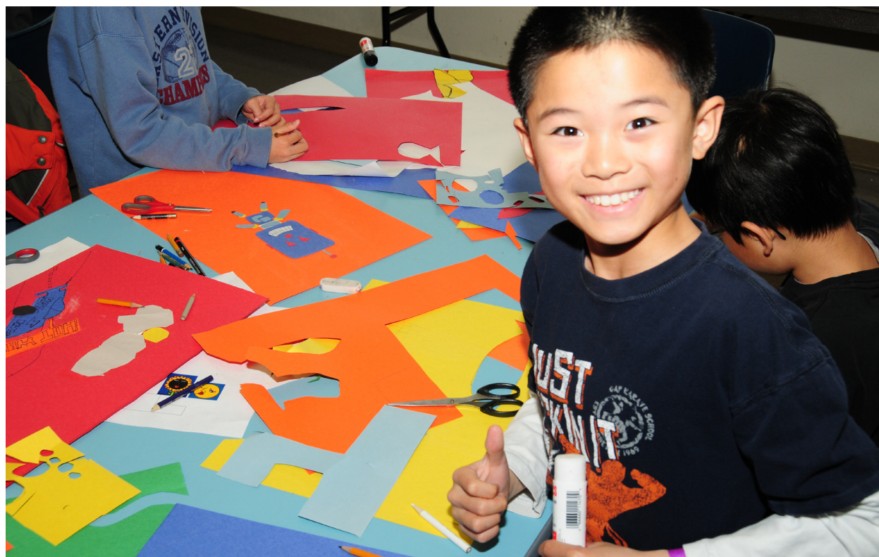
Second Annual Children's Art Festival, Richmond Cultural Centre

opportunity for preschool and elementary students to participate in hands-on interactive workshops with professional performers and visual artists. Approximately 600 children from Richmond Schools attended during this two-day Arts Education event. Workshops were sold out months in advance.