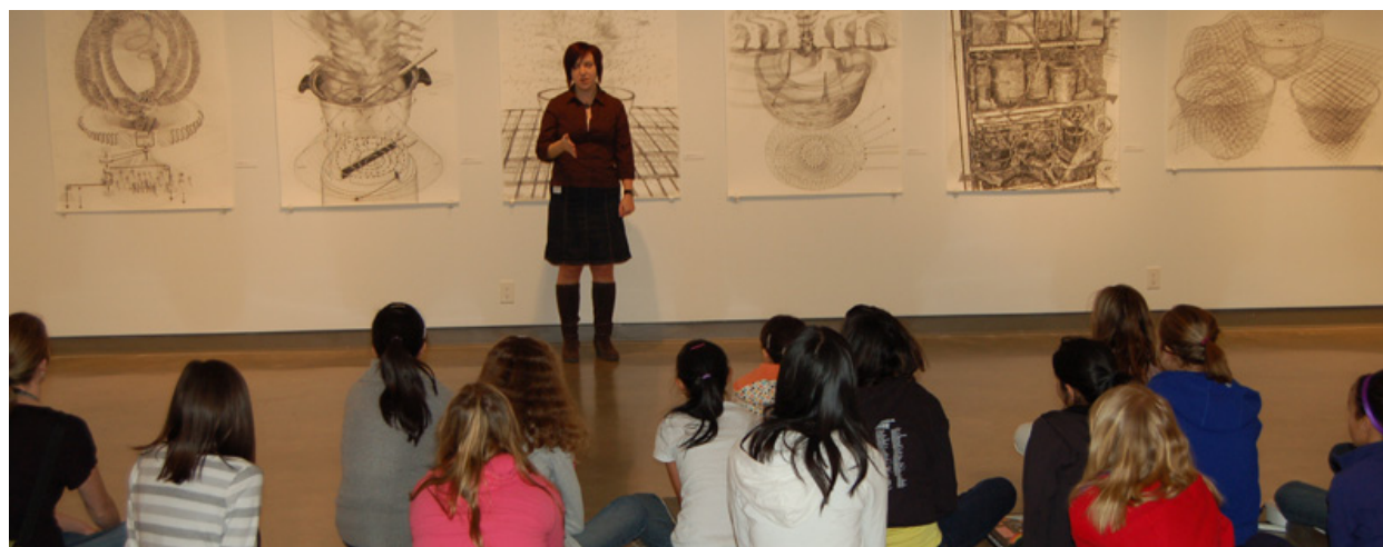
School Art Program, Richmond Art Gallery

The Richmond Art Gallery School Art Program provides hands-on art experiences for young artists. The program introduces students, from Preschool to Grade 7, to the exciting world of contemporary art through interactive gallery tours and exhibition-based, hands-on art activities and helps to develop visual literacy and critical thinking skills. From March to June 2010, the Gallery conducted 53 school tours and workshops, representing 1,238 students and conducted a Pro-D workshop with regional teachers.