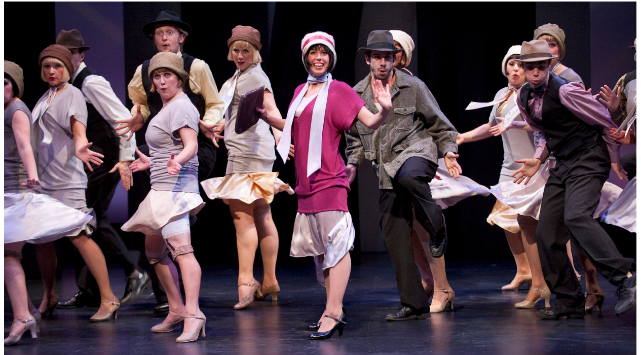
Thoroughly Modern Millie , Gateway Theatre

Starting off on the Main Stage was The Foursome , a whimsical comedy using golf as a metaphor for relationships. It was a joint production with Kamloops's Western Canada Theatre where it enjoyed a successful run after it closed at Gateway. Modern Millie involved a large cast of a core group of professionals, supported by up and coming actors, emerging designers and the best professional pit orchestra in the Lower Mainland. Around the World in 80 Days , featuring a multicultural cast of five actors playing almost forty roles, brought