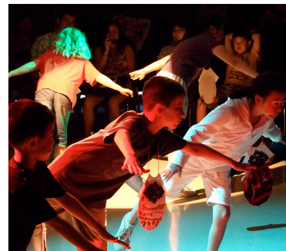
Performing and Art class, Richmond Arts Centre

Three weeks of Byte Camps were packed to capacity exposing children to the world of Media Arts. Camps included 3D animation, claymation and flash video game design. The camp also ensured that students went outside and engaged in physical activity at least three times per day. Children received a USB wristband with their projects at the end of the week.