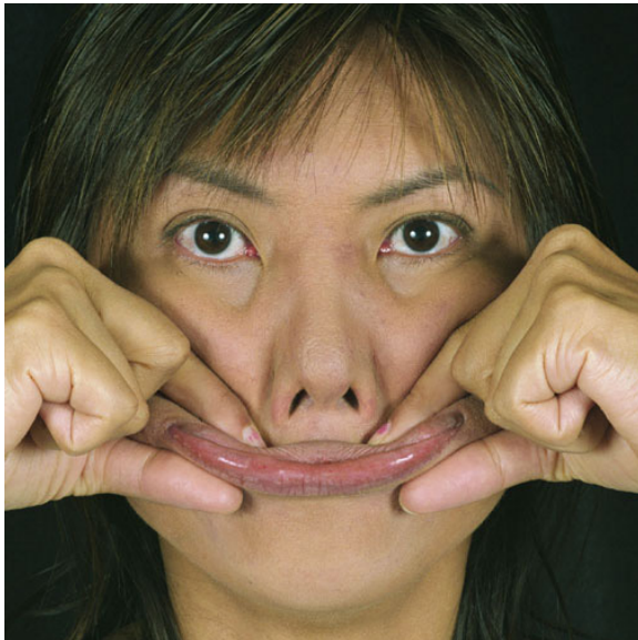
Arthur Renwick, Carla , 2006, photograph

Overall attendance during the exhibition: 16,065.