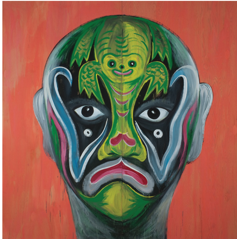
Wanda Koop, Victim , 1985, acrylic on plywood