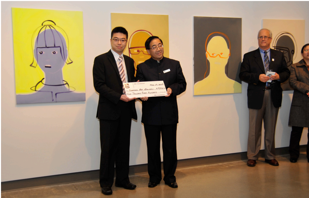
Wanda Koop, Hybrid Human , 2009, acrylic on canvas