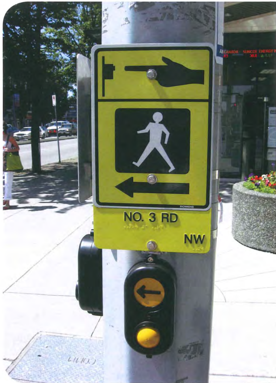
CNCL - 118