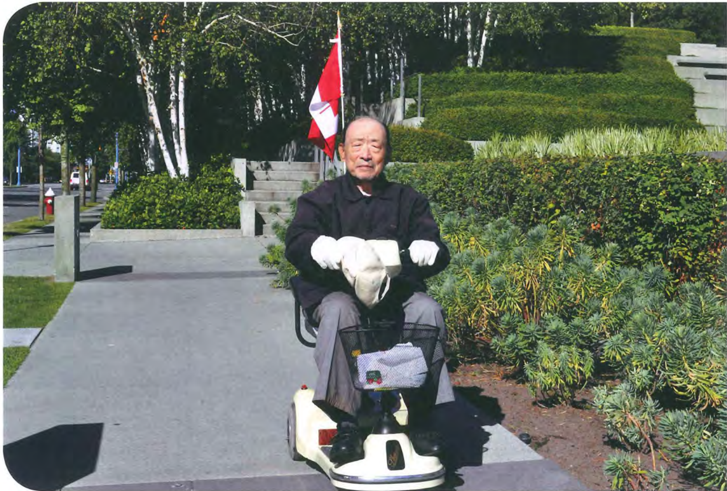
CNCL - 122