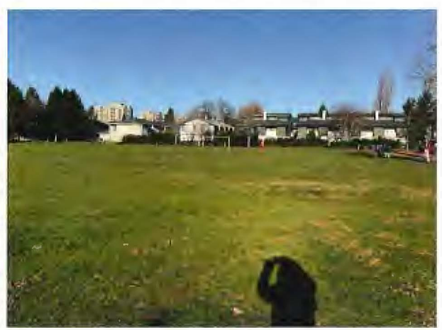
Figure 4 – Sports fields