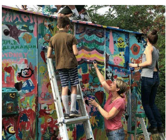
From left to right: art workshop with displaced Central Americans, Arizona; Graphic novel workshops, Syria, 2015; painted mural, Syria, 2016; community mural, Kirkland, WA, 2018.