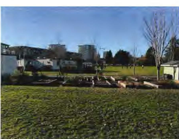
Figure 2 – Garden beds