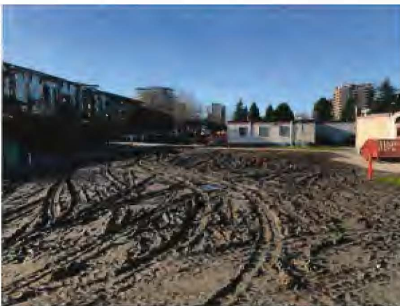
Figure 6 – Outdoor green space in progress for spring 2021