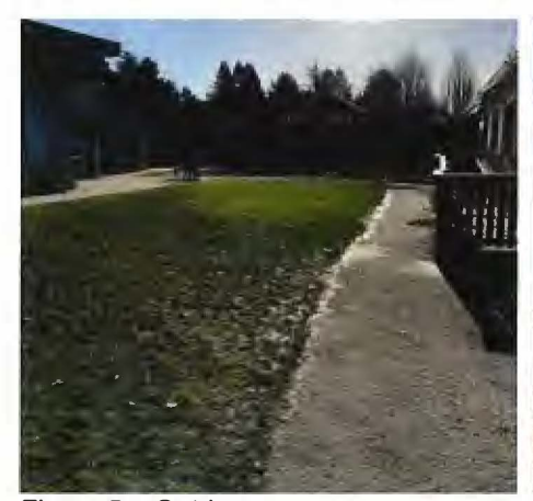
Figure 5 – Outdoor green space