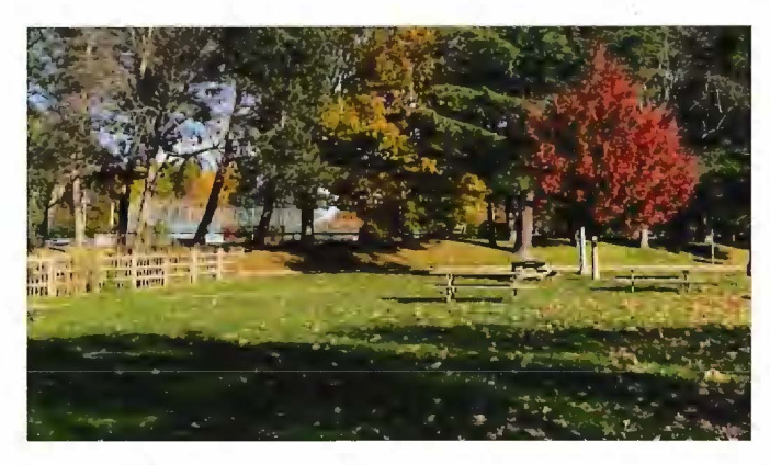
Figure 4. Steveston Branch Outdoor Spaces