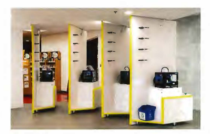
Figure 5. 3D printers