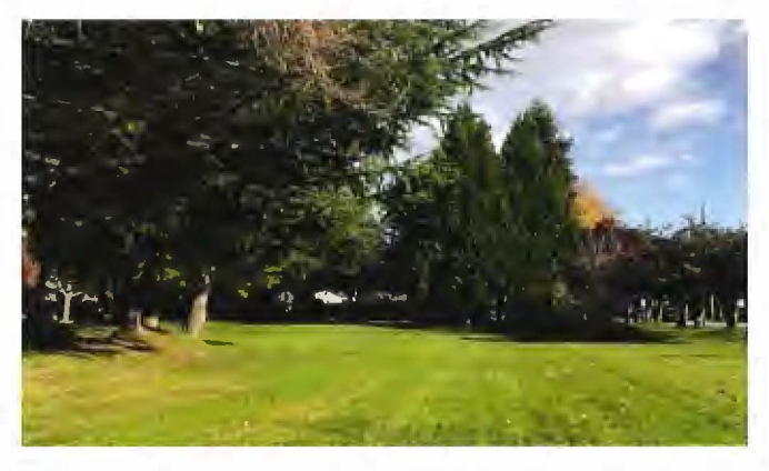
Figure 3. Steveston Branch Outdoor Spaces