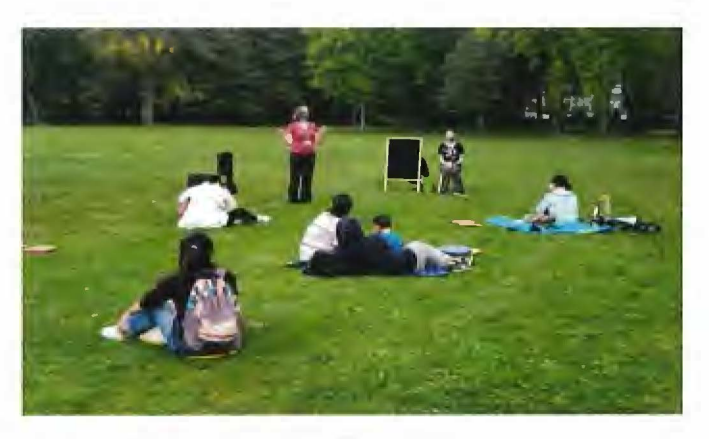
Figure 2. Richmond Brighouse Branch Outdoor Spaces