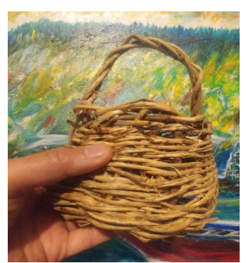
From left to right: carved bench, Pat Calihou; workshop concepts, J Peach; Nomadic Nest, Yolanda Weeks; Gallery Gachet Art Cart (example of mobile sculpture); wild crafting and weaving (example)