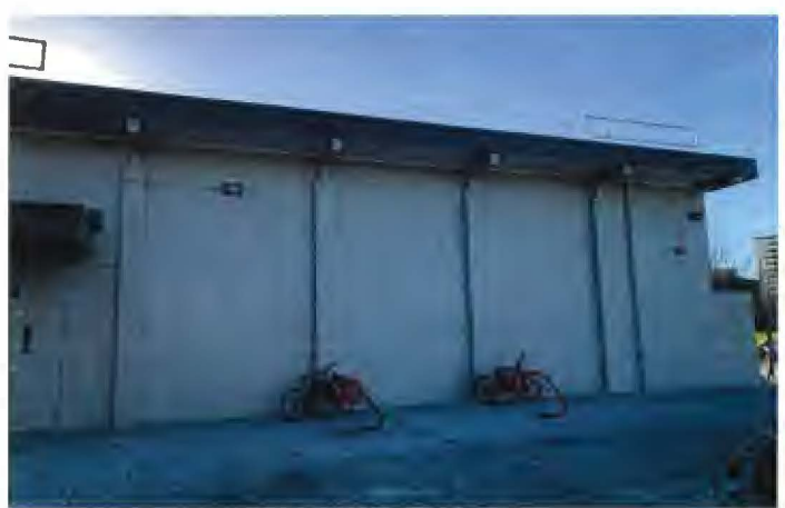
Figure 3 - Outdoor entrance/gathering space