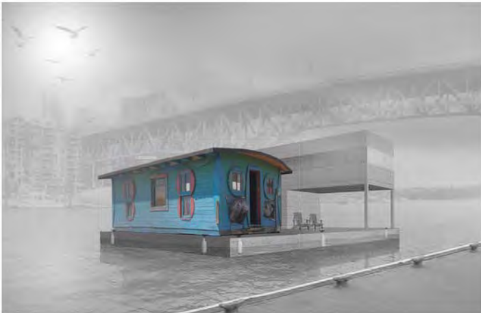
Architectural visualization only

In 2014, grunt gallery began working in partnership with Other Sights for Artists' Projects (Other Sights) and Creative Cultural Collaborations (C3) to develop the concept for a permanent engagement site for the Blue Cabin.