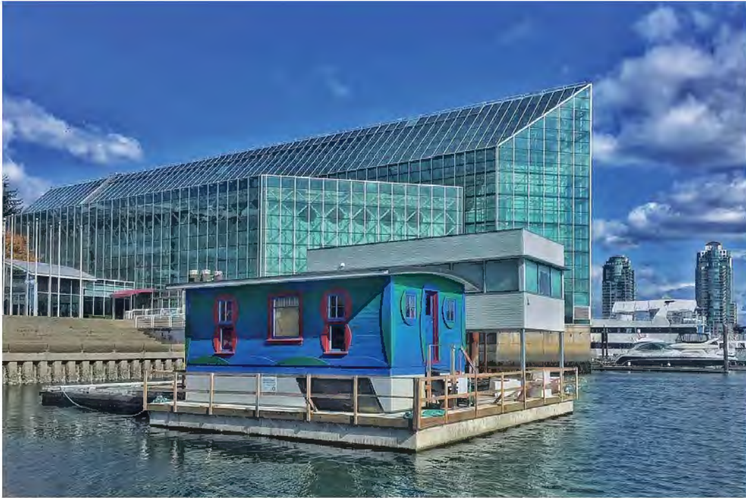
Thanks for your support!