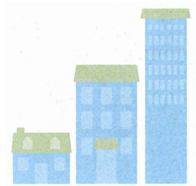
Number of people experiencing homelessness who reported an addictions issue:

The increasing complexity of factors contributing to poverty and homelessness combined with the multifaceted needs of individuals experiencing homelessness and the lack of appropriate affordable housing options have affected the ability of the City and its partners to adequately address the needs of some of Richmond’s most vulnerable. The City has taken significant action in 2023 to respond to the needs of individuals experiencing homelessness and the impacts on the community and public spaces.