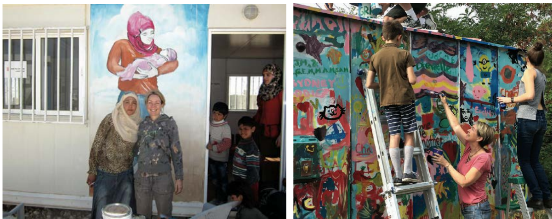
From left to right: art workshop with displaced Central Americans, Arizona; Graphic novel workshops, Syria, 2015; painted mural, Syria, 2016; community mural, Kirkland, WA, 2018.