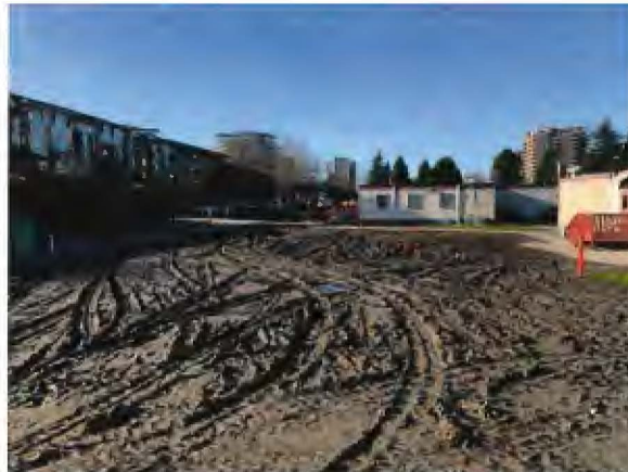
Figure 6 – Outdoor green space in progress for spring 2021