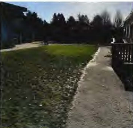
Figure 5 – Outdoor green space