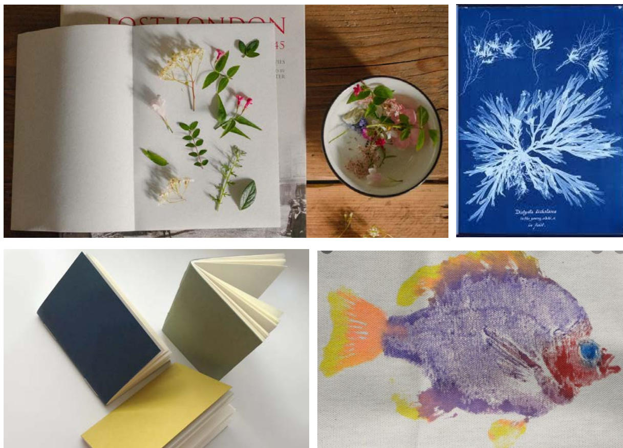
From left to right: field journaling, cyanotype printing, book making and Gyotaku Japanese printmaking.