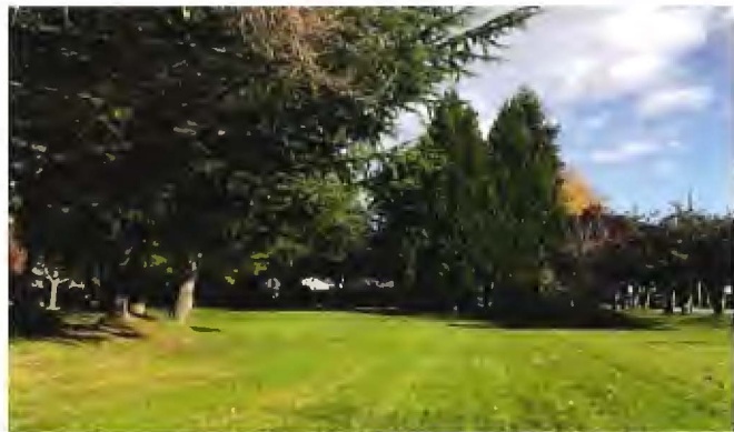
Figure 3. Steveston Branch Outdoor Spaces