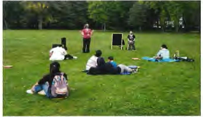
Figure 2. Richmond Brighthouse Branch Outdoor Spaces