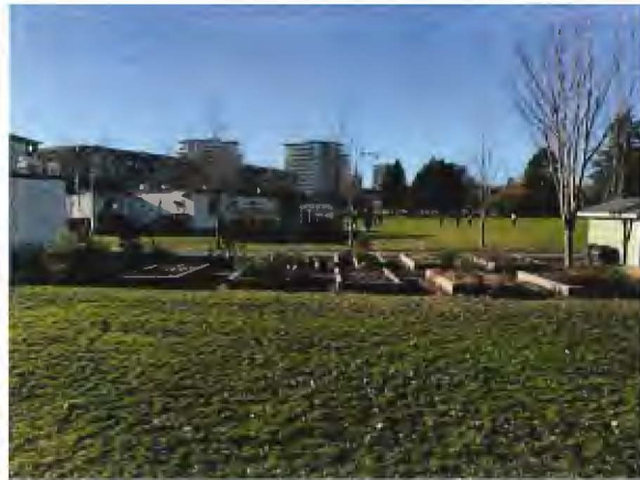
Figure 2 – Garden beds