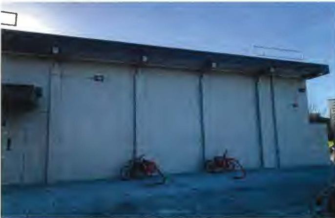
Figure 3 – Outdoor entrance/gathering space