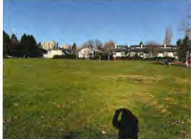
Figure 4 – Sports fields