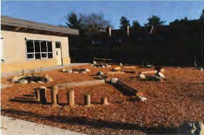
Figure 1 – Outdoor Learning Space