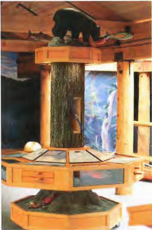
Figure 3 and 4 – Bear sculpture, Waterton Lakes and Salmon Grows in Trees Exhibit, Kwisitis Centre, Pacific Rim National Park Reserve, Uclulet, B.C.