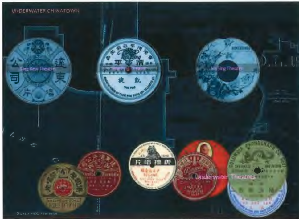
Figure 1. Faith Moosang and Deanne Achong, Underwater Chinatown , 2016, https://underwaterchinatown.com , Interactive Website, Cinevolution Media Society