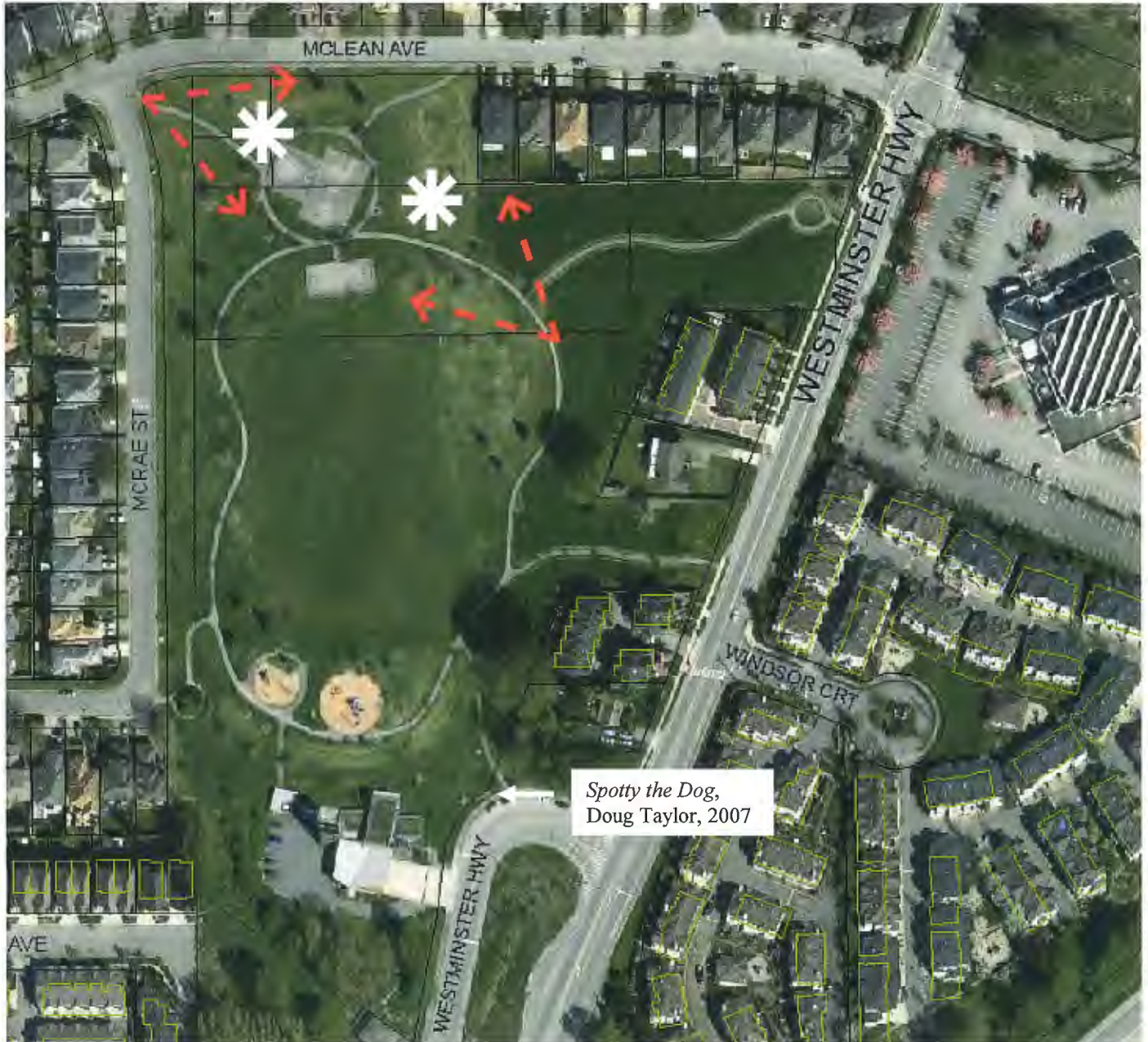
Figure 1. McLean Community Park showing possible locations for artwork.