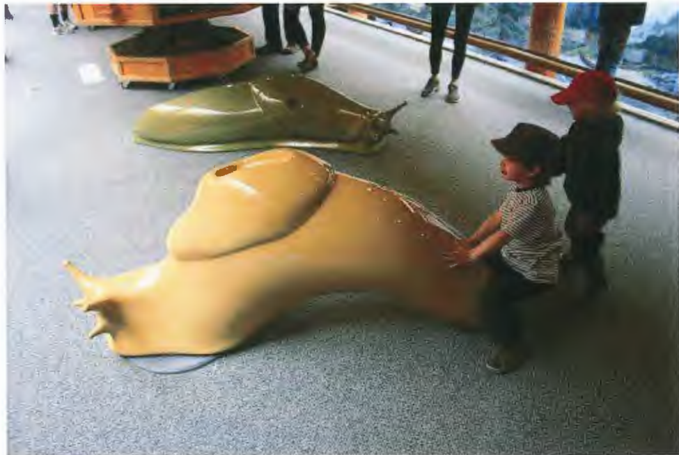
Figure 5 - Giant fiberglass slug play structures Kwisitis Centre, Pacific Rim National Park Reserve, Uclulet, B.C.