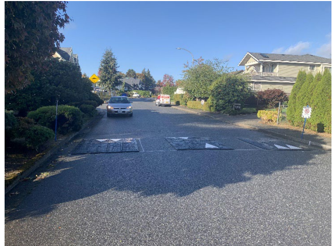
Figure 2: Kittiwake Drive Temporary Speed Cushion

As these speed cushions were the first to be introduced on a local roadway in Richmond, temporary pre-fabricated speed cushions were installed on a trial basis for six months as approved by Council. Installation occurred on October 27, 2022 (Figure 2) and the six month pilot project is now complete.