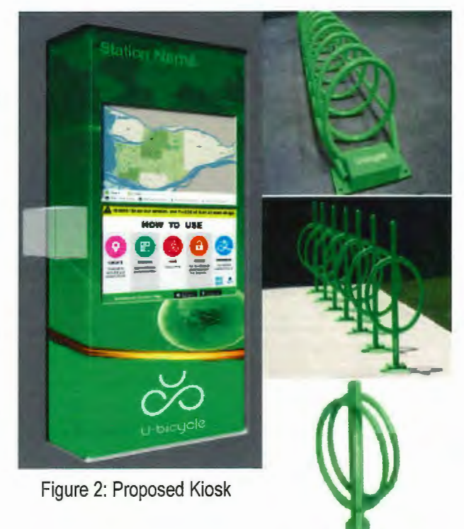
Figure 3: Proposed

The bicycles have a chip and are GPS-ready; however, initially, the device will not be enabled, which limits the ability to track the real-time locations of bicycles between trips. U-bicycle is currently pursuing the certification process to enable the GPS device (estimated to take six months as of June 2018). U-bicycle will monitor the usage of the bikes in the initial weeks after the launch and commits to activating the GPS in all bikes by the beginning of January 2019 if issues are demonstrated to arise (e.g., incorrectly parked bikes, theft of bikes).