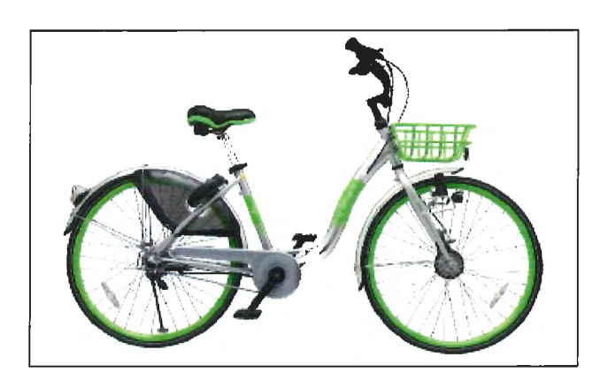
Figure 1: Proposed U-bicycle Model

System users will be able to rent bicycles at one location and end their trip at another location through a self-service process available 24/7 during the pilot period. Each self-locking bicycle has a helmet that locks to the frame of the bike and helmet liners will be available via a kiosk at stations. Additional bicycle features include automatic front and rear lights, an adjustable seat height, front cargo basket and cup holder, bell, and three gears (Figure 1). Instructions on how to use the U-bicycle system and customer service hotline number are provided on the rear-wheel guard and the basket.