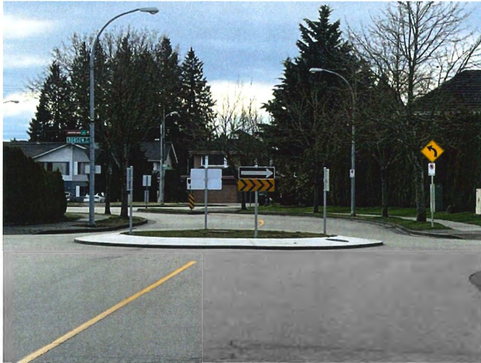
Figure 2: Installation of Traffic Circle at Barnard Dr. /Lam Dr. /Robson Dr. Intersection

Over the past 5 years, ICBC has contributed over $1.2M towards road improvement projects within Richmond, which helped facilitate improvements to the top 20 collision-prone intersections within the City, the installation of 35 video detection cameras, 6 new traffic signals, 43 LED overhead street name signs, 13 special crosswalks, 35 speed humps and uninterrupted power supply at 38 intersections.