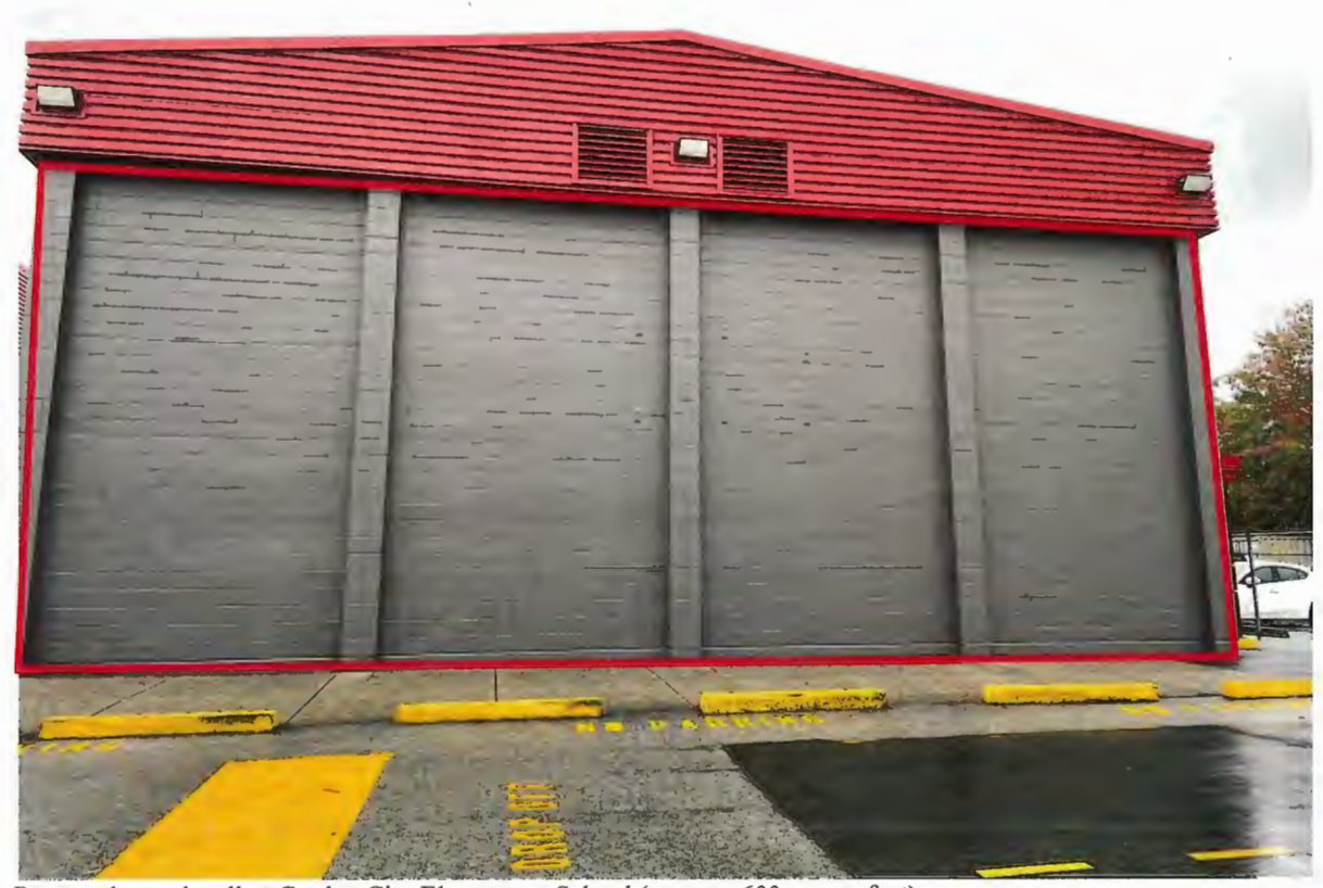
Proposed mural wall at Garden City Elementary School (approx. 600 square feet)