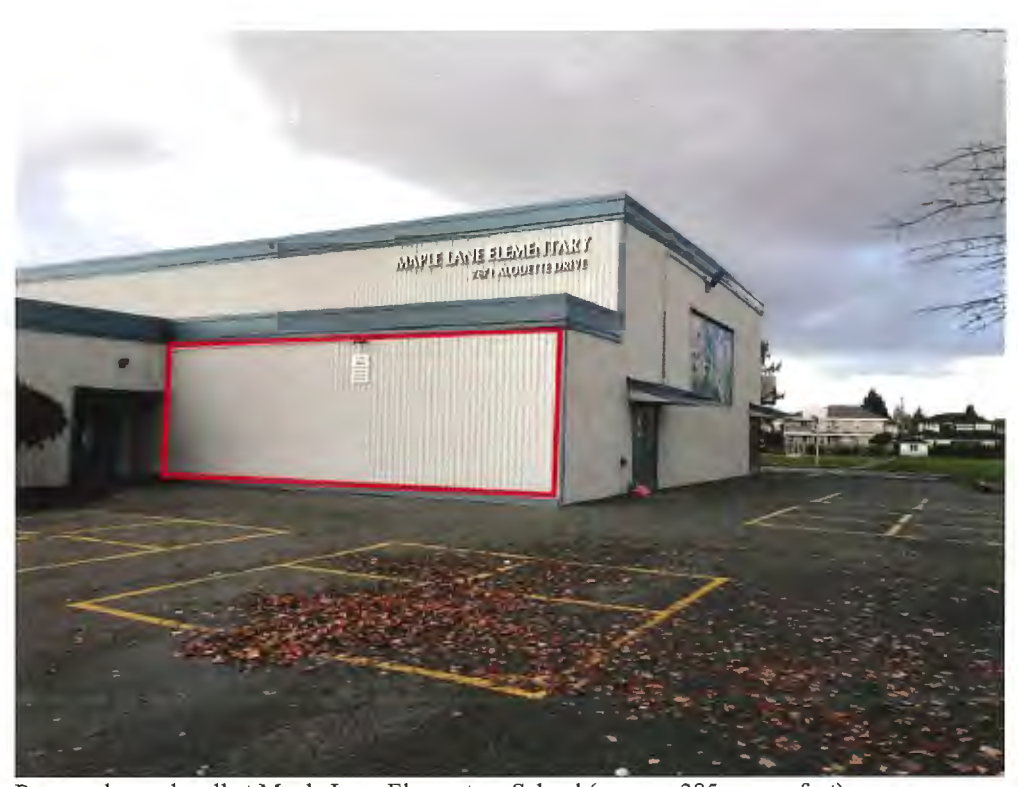
Proposed mural wall at Maple Lane Elementary School (approx. 385 square feet)