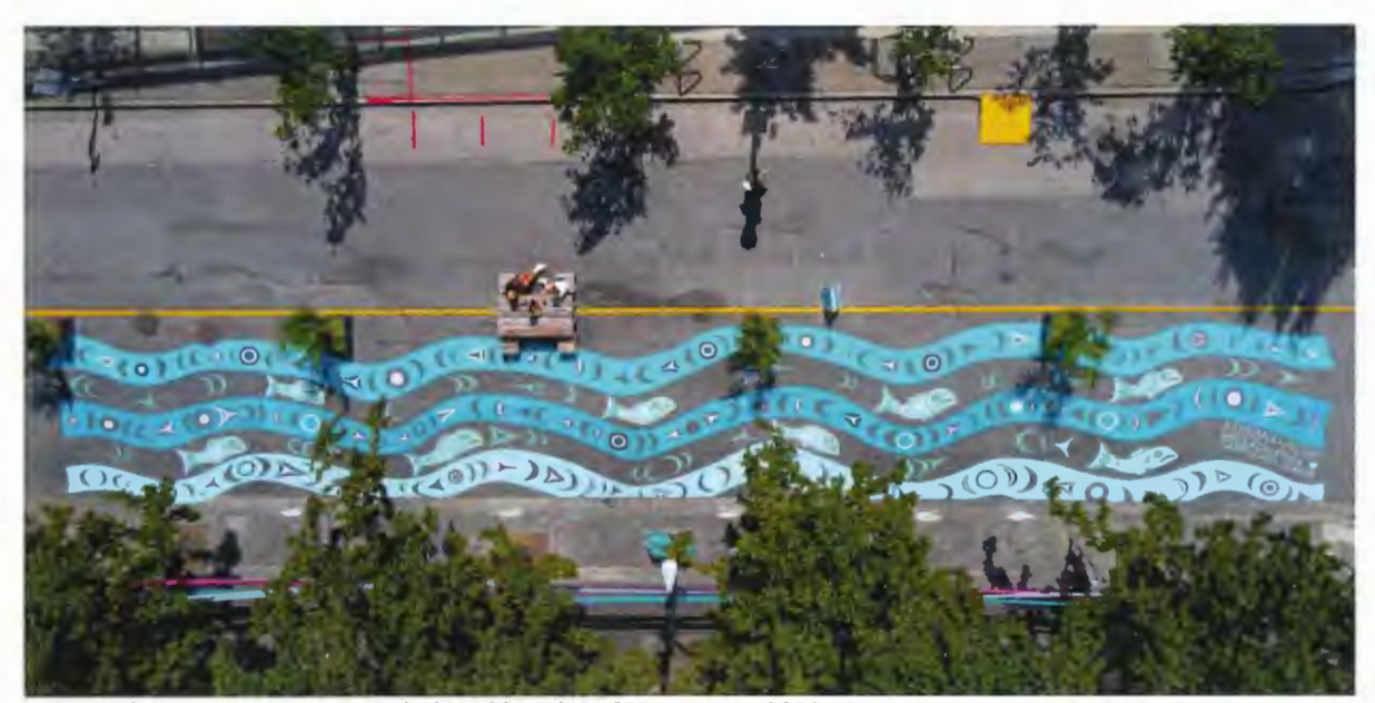
Athena Picha, Waterways, commissioned by City of Vancouver, 2021