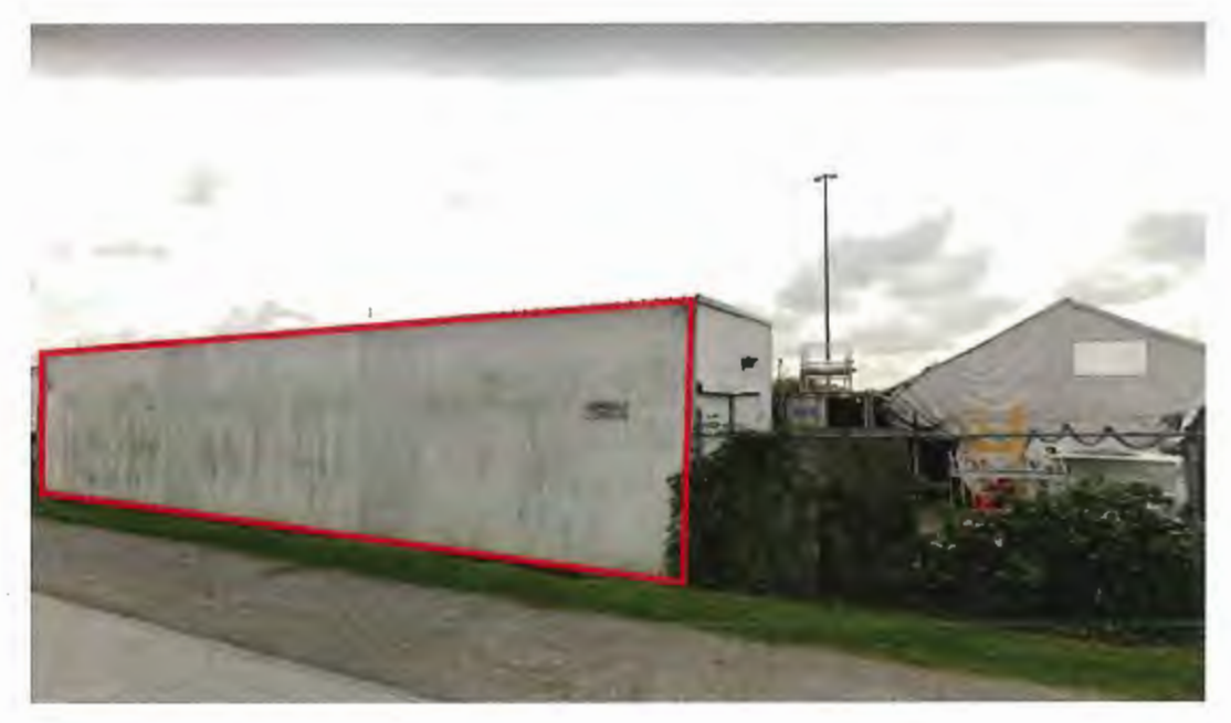
Proposed mural wall at Steveston Harbour Authority (approx. 1,000 square feet)