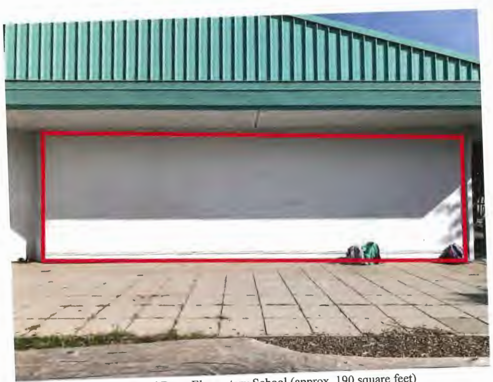
Proposed mural wall at Lord Byng Elementary School (approx. 190 square feet)