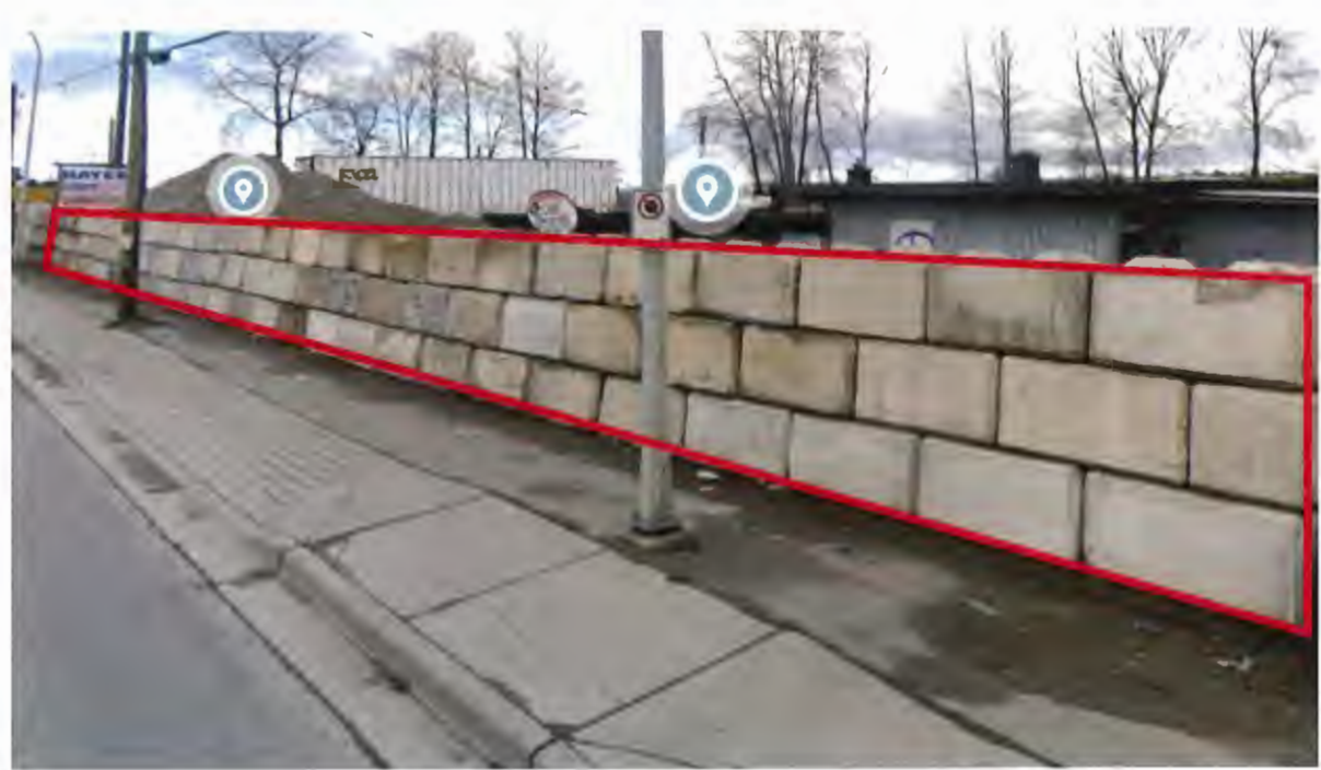
Proposed mural wall at Hayer Demolition (approx. 900 square feet)