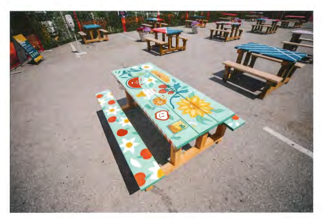
Laura Kwok, Picnic Feast, for Tourism of Richmond, 2021.