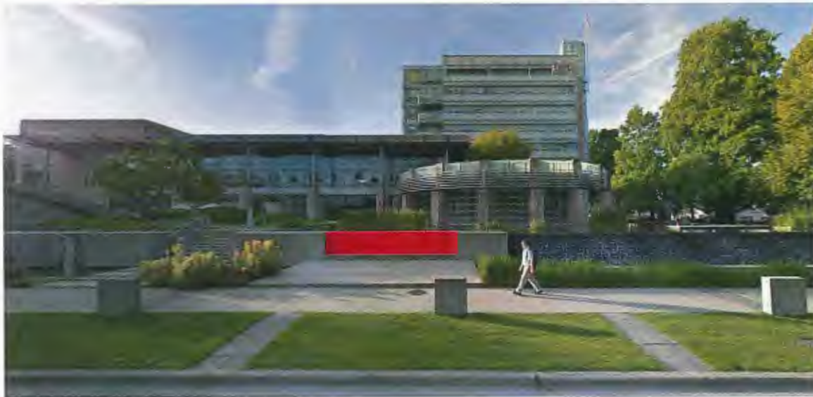
Figure 2 – Concrete retaining wall location highlighted in red.