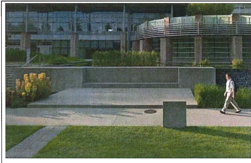
Figure 1 - Richmond City Hall, artwork location facing Granville Avenue.