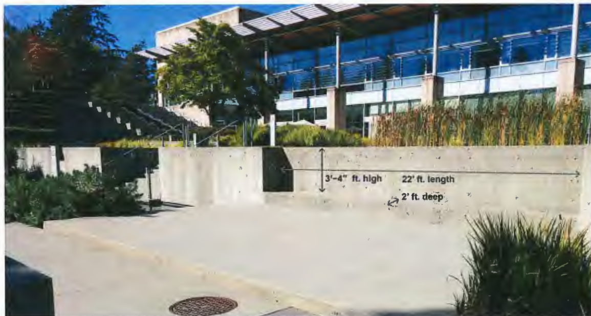
Figure 3 – Artwork dimensions should not exceed 22' length x 3'-4" high x 2' deep.