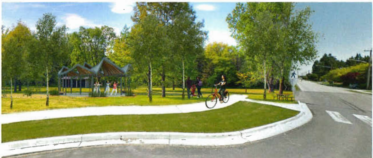
Figure 4 – Artist rendering of Wake from River Road park entrance.