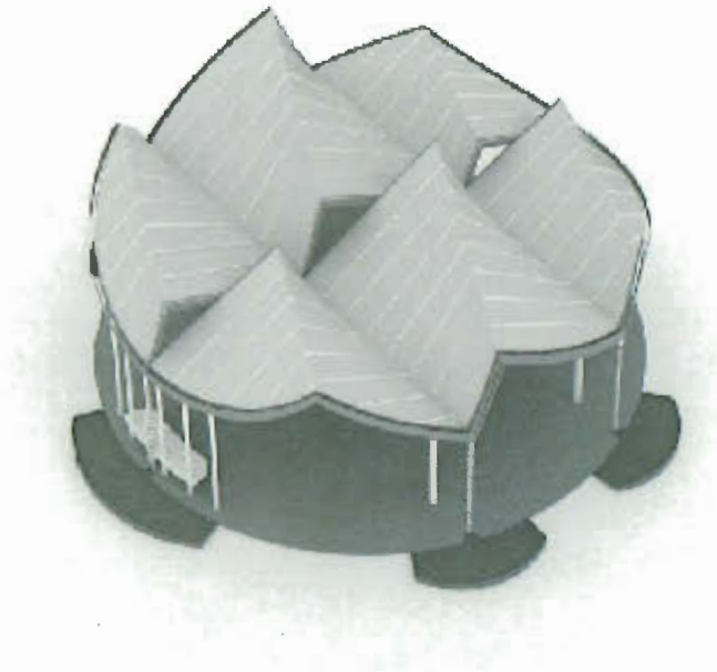
Figure 1 – Artist three-dimensional rendering of Wake .