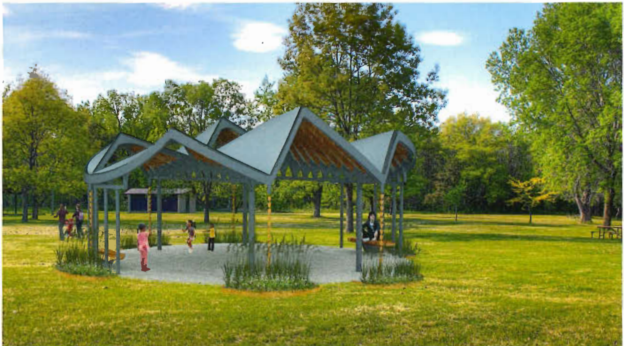
Figure 2 – Artist three-dimensional rendering of Wake in an imagined park setting.