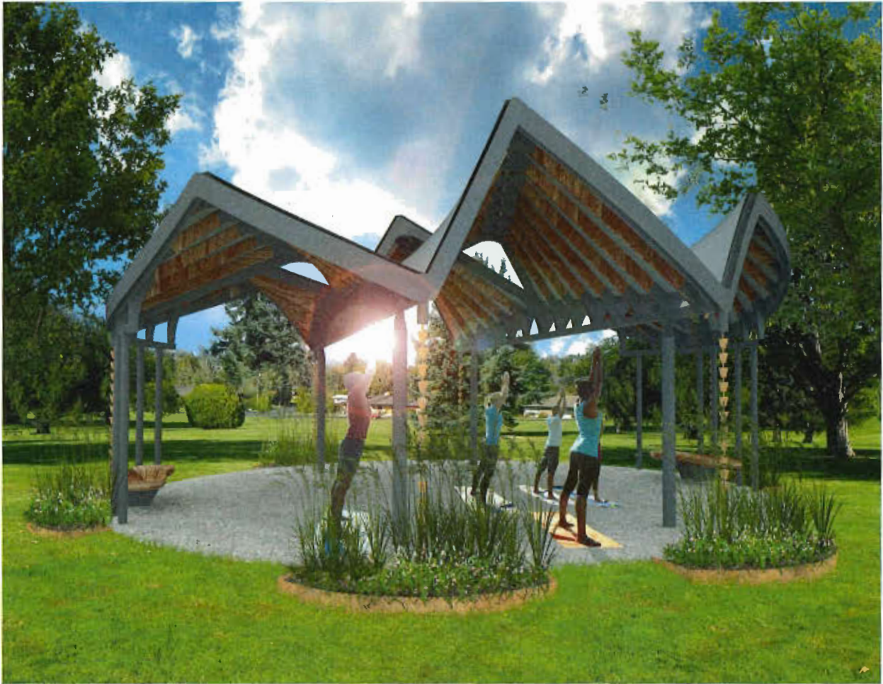
Figure 3 – Artist rendering illustrating health and wellness-based programming for local community members.