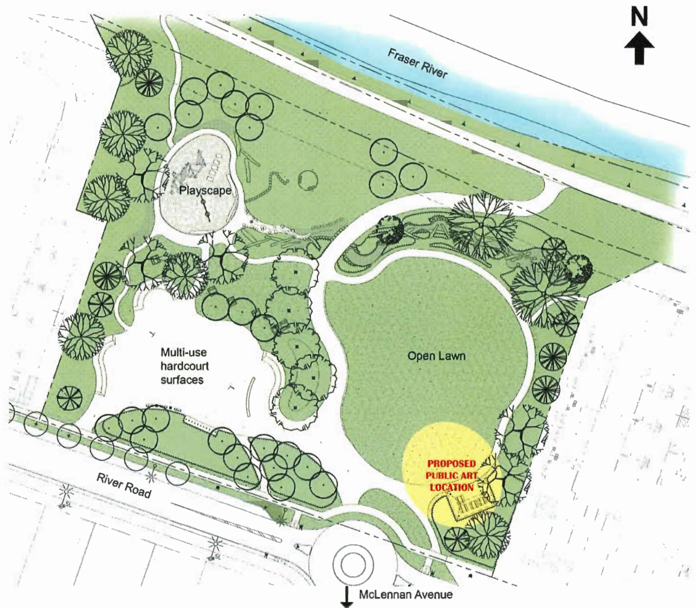
Figure 1. Proposed Site Plan for Tait Waterfront Park showing general location of the public artwork.